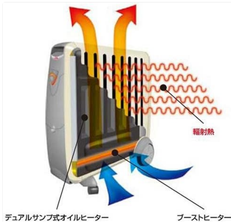
Figure 2: Diagram showing the internal heating mechanism, including the dual-sump oil heater and boost heater, and the emission of radiant heat.