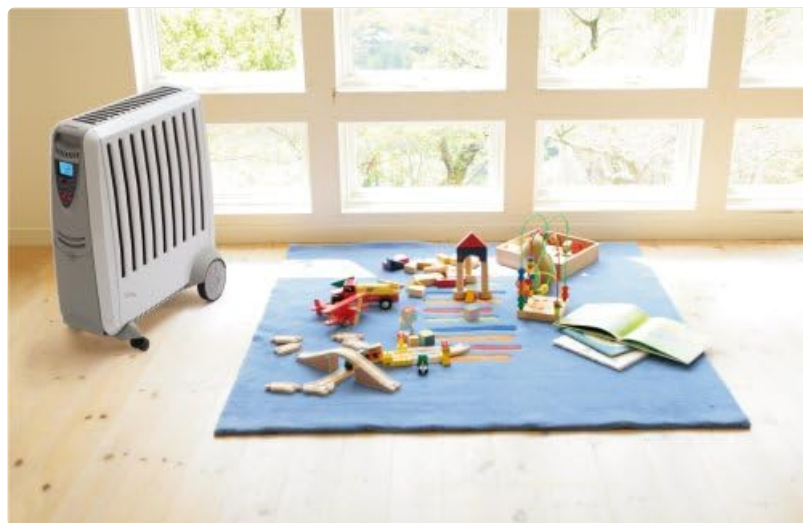
Figure 5: Example of proper heater placement in a room, ensuring adequate clearance from surrounding objects.

Place the heater on a firm, level surface. Ensure there is at least 1 meter (3 feet) of clear space around the heater from walls, furniture, and other objects to allow for proper air circulation and prevent fire hazards. Do not place the heater directly below a power outlet. Avoid placing it in high-traffic areas where it could be easily knocked over.