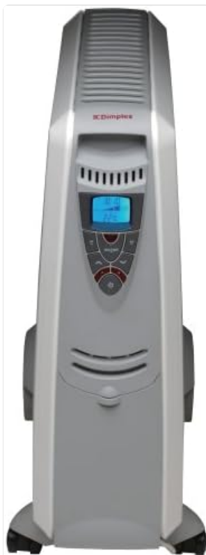
Figure 1: Front view of the Dimplex CADIZ Oil Heater ROF14ECCJ, showing the control panel and sleek design.

The Dimplex CADIZ Oil Heater ROF14ECCJ is an advanced electric oil heater designed to provide comfortable and consistent warmth for your living space. Featuring a unique dual-sump oil heater system combined with a boost heater, it offers efficient and rapid heating. This model includes a digital timer, child lock, and remote control for convenient operation.