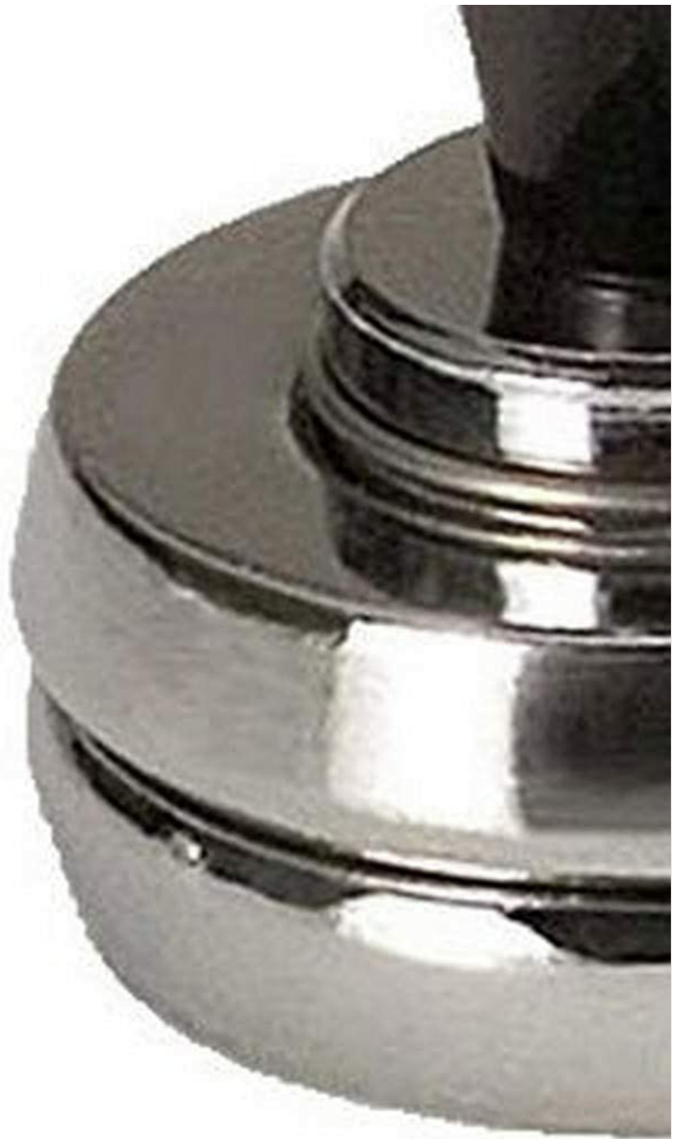
Image: Presto 50332 Pressure Regulator with one 5-pound weight ring attached. The central stem with a black handle is visible, along with one silver weight ring.