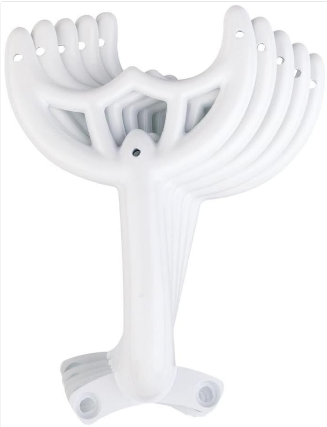
Figure 1: Westinghouse 52-Inch White Finish Replacement Fan Blade Arms (Five-Pack)