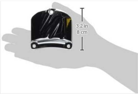
Image Description: A hand holding the smaller chrome accent piece, with an overlay indicating its dimensions: 3.2 inches (8 cm) in height.