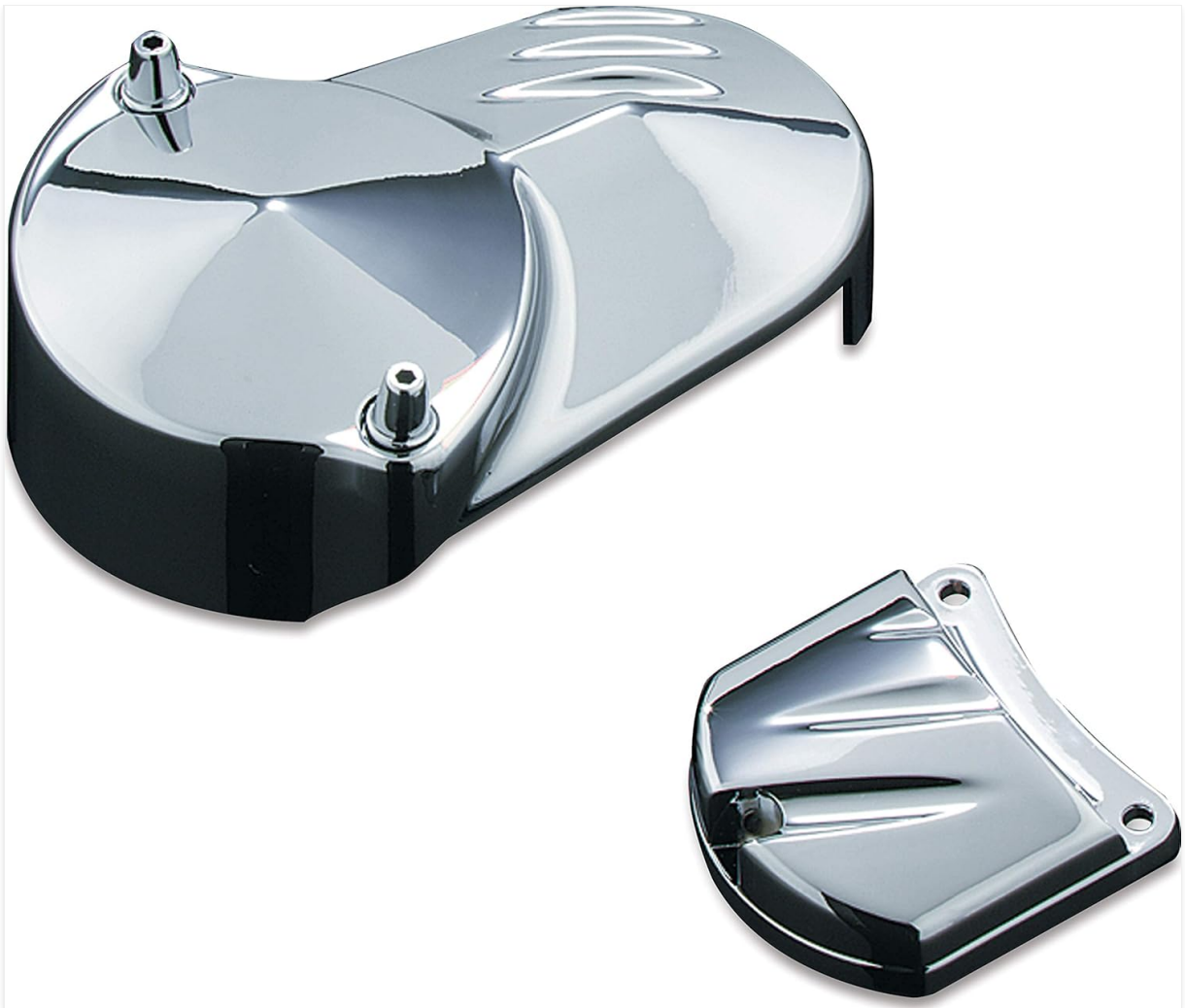
Image Description: A chrome solenoid cover, the main component of this kit, shown alongside a smaller accent piece. The larger cover is designed to fit over the motorcycle's solenoid.