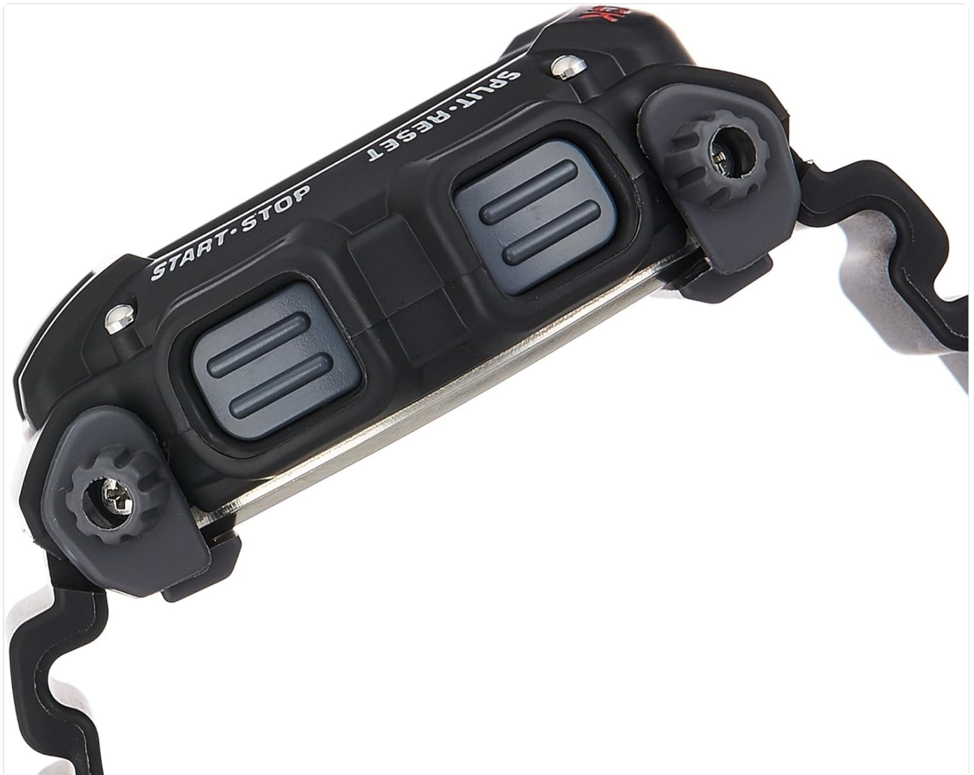
Figure 2: Side view of the Casio G-Shock DW9052, highlighting the robust casing and accessible control buttons.

The watch features a multi-alarm system and an hourly time signal. The flash alert function causes the backlight to flash when the alarm sounds or the hourly time signal is emitted.