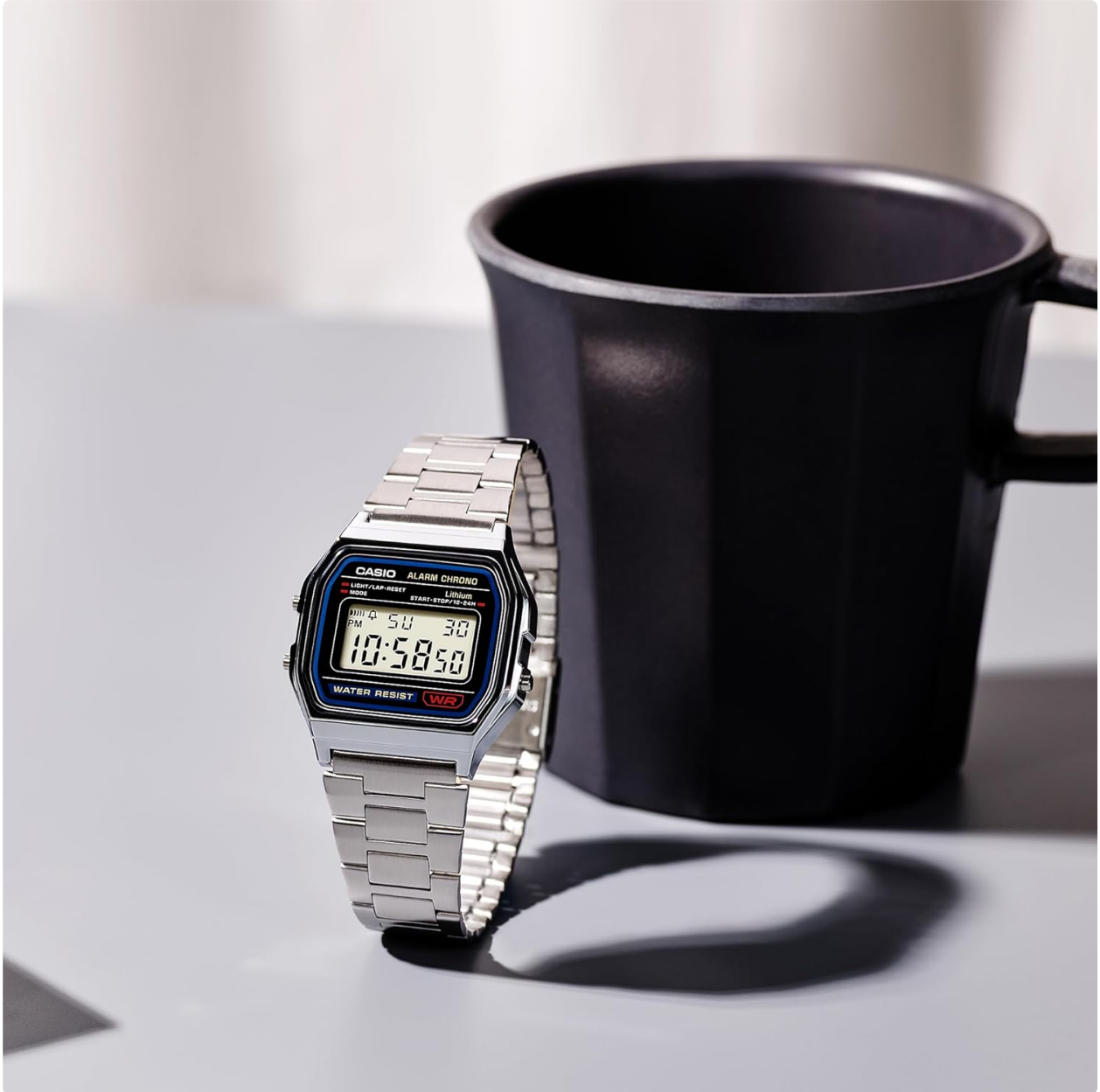
Figure 2: The Casio A158WA-1 Digital Watch in a lifestyle setting, highlighting its compact size and classic appeal.

The stainless steel bracelet can be adjusted to fit your wrist. Locate the clasp and lift the small lever. Slide the clasp along the bracelet to the desired position and press the lever down firmly to secure it. Ensure it clicks into place to prevent accidental opening.