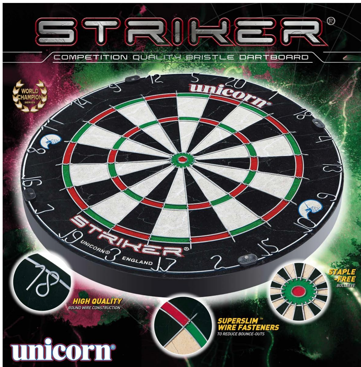
Image: The Unicorn Striker Dartboard highlighting its competition quality, round wire construction, SuperSlim wire fasteners, and staple-free bullseye. This image emphasizes the board's advanced features.