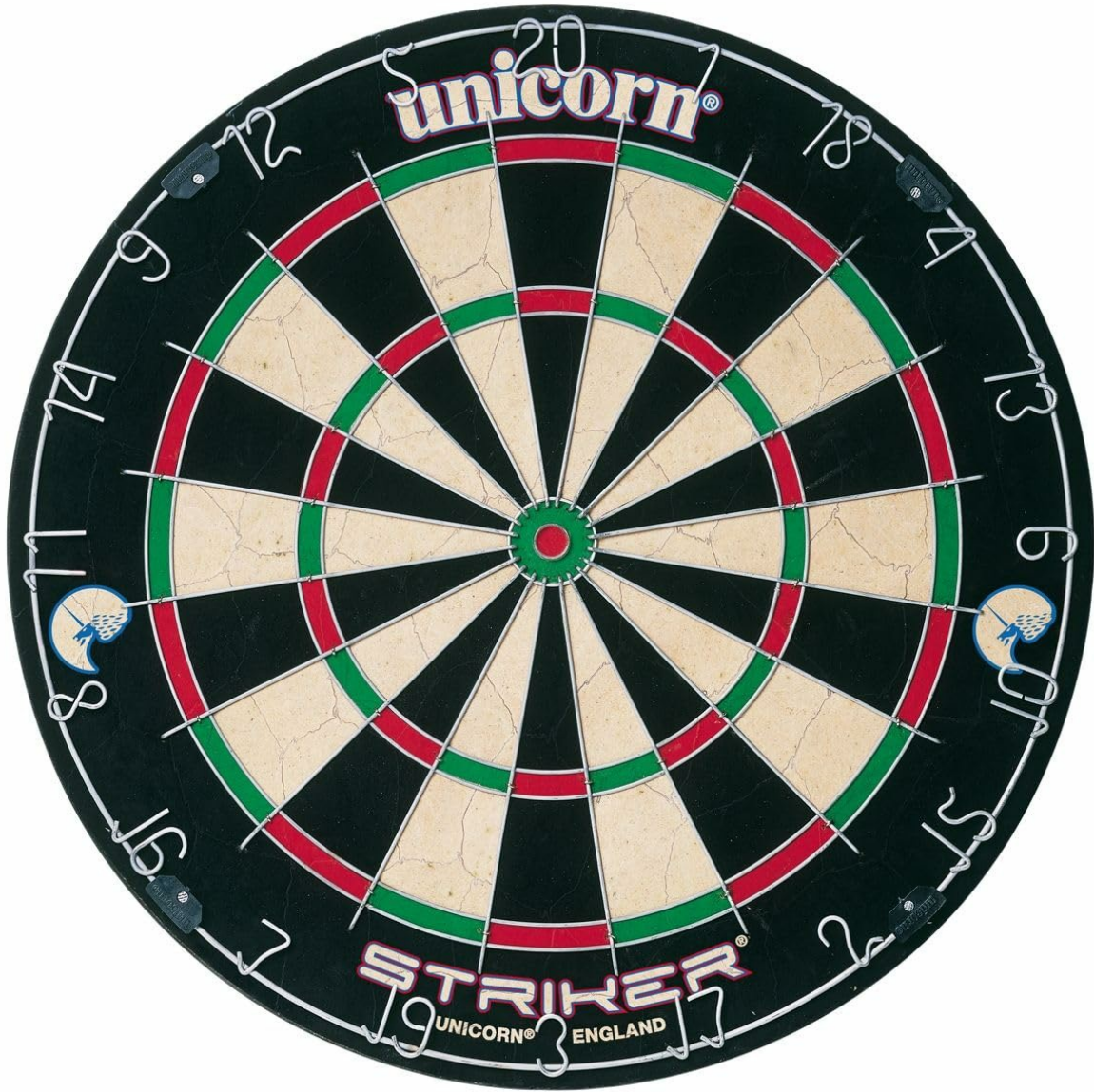
Image: The Unicorn Striker Dartboard, showcasing its classic design with black, white, red, and green segments.