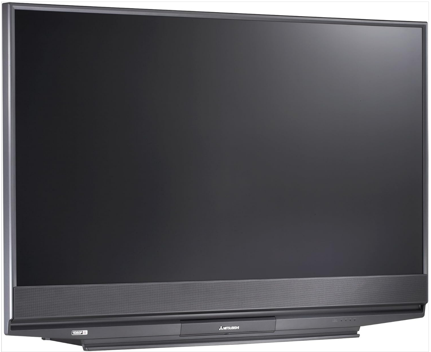
Figure 2.1: Front view of the Mitsubishi WD-65731 65-Inch 1080p DLP HDTV. This image shows the television's display and integrated speaker bar.