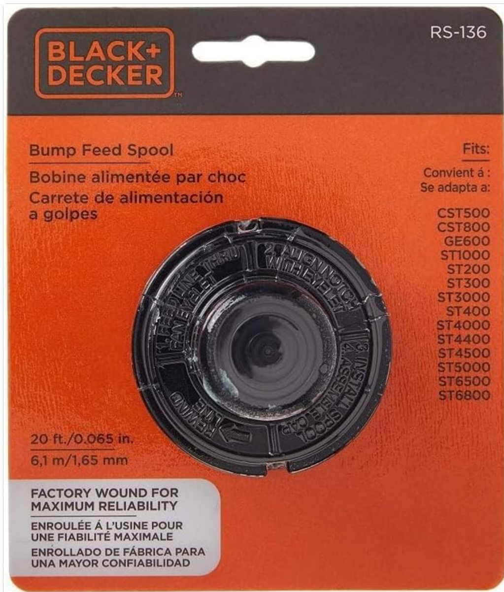
Image: The BLACK+DECKER RS-136-BKP replacement spool, factory wound with .065-inch trimmer line.