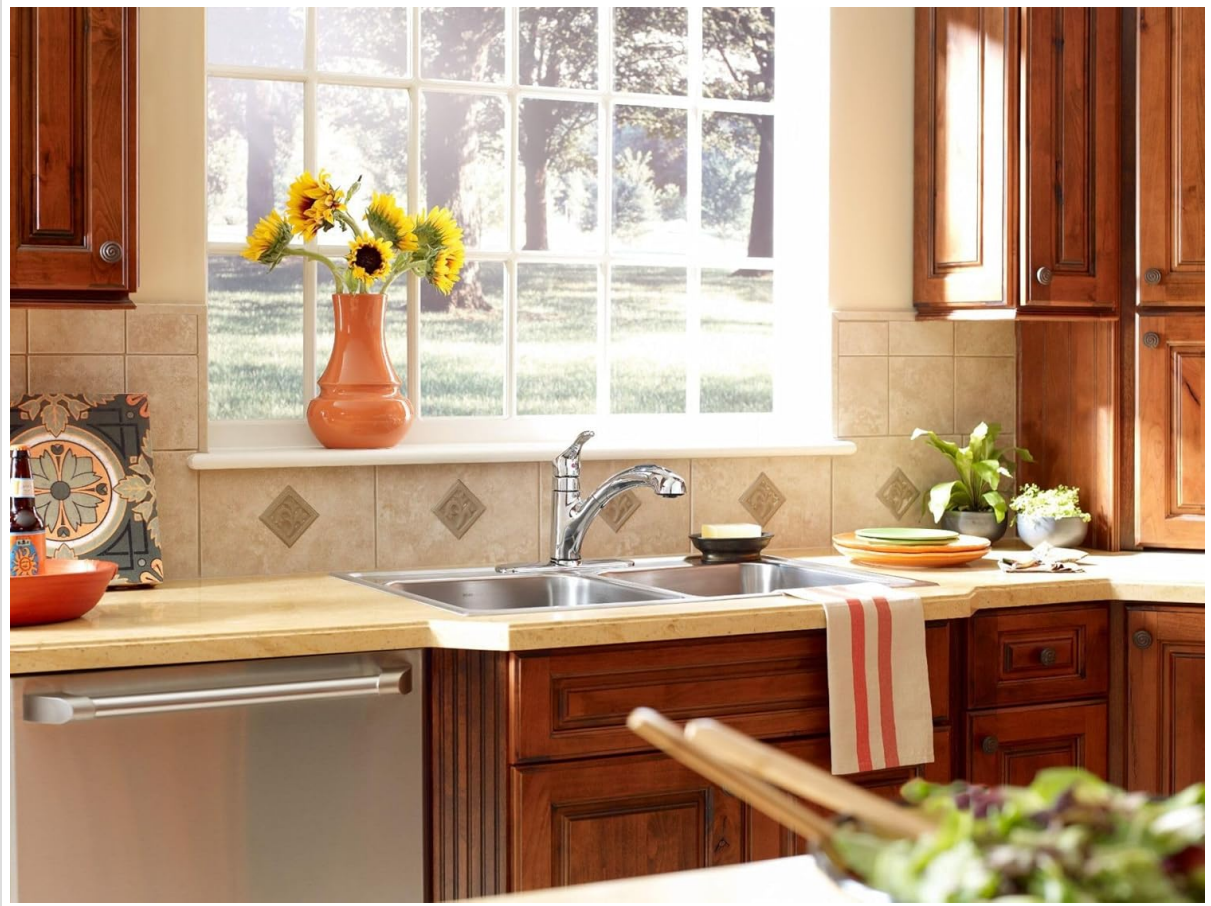
Image 1.2: The Moen Renzo faucet seamlessly integrated into a kitchen environment.