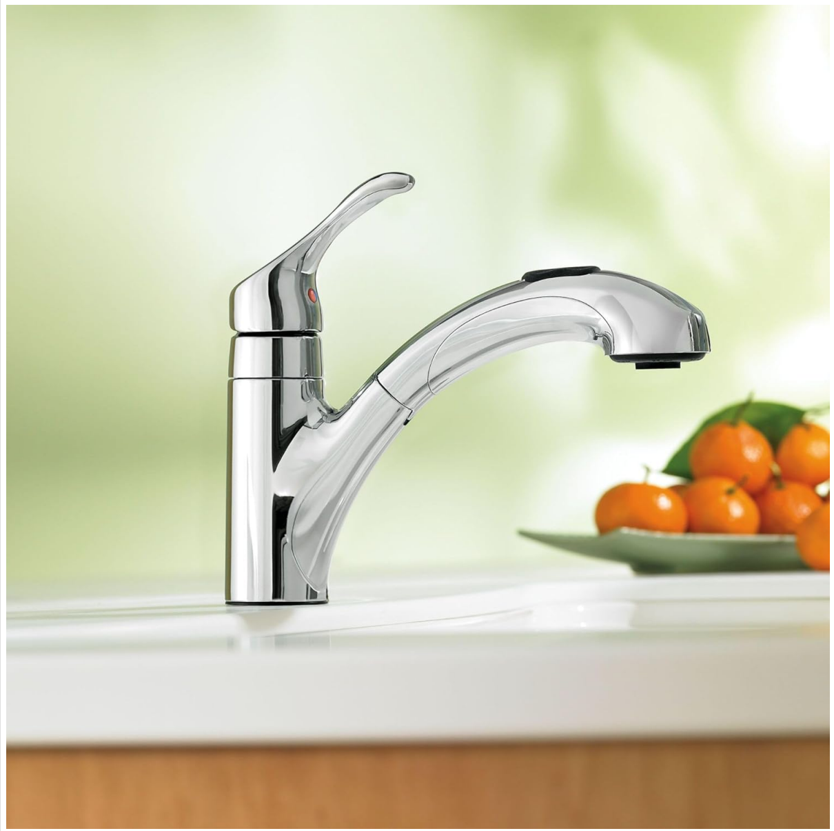
Image 1.1: Moen Renzo Single Handle Low Arc Pullout Kitchen Faucet in Chrome finish.