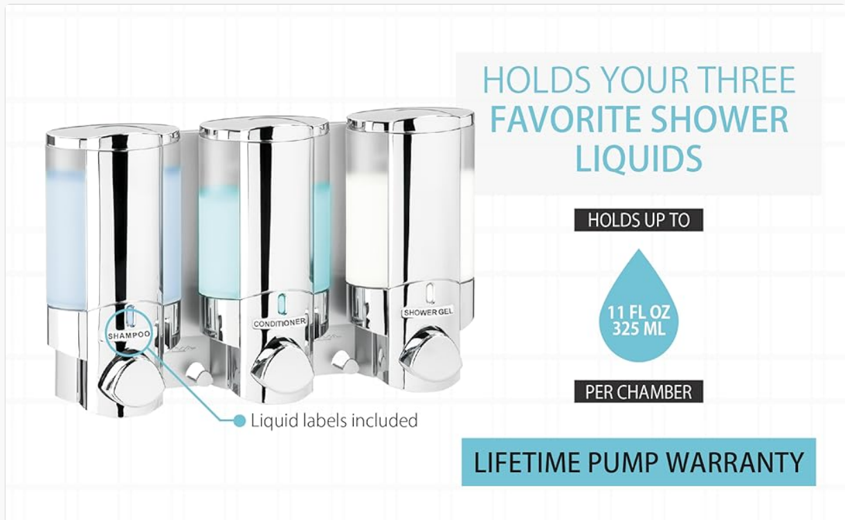
Image: Effortless one-handed dispensing of liquids.