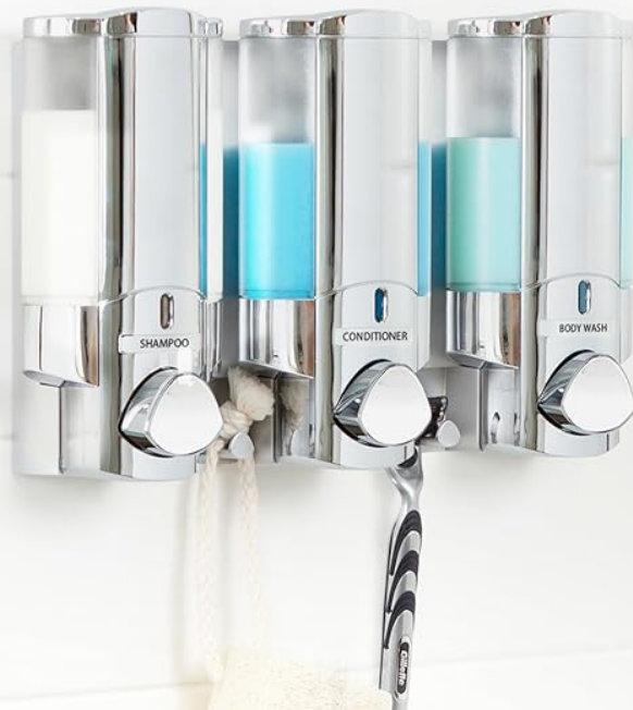
Image: Integrated hooks provide convenient storage for razors and loofahs.

DE-CLUTTER YOUR SHOWER WITH NO MORE MESSY BOTTLES