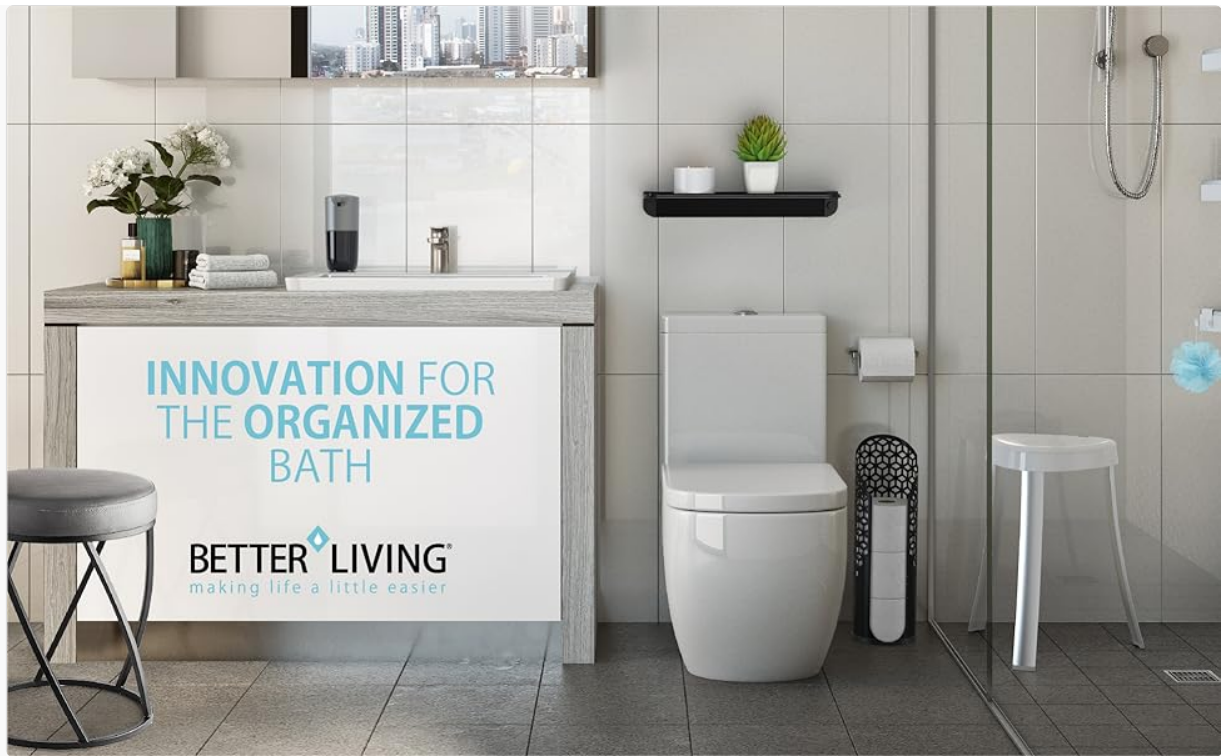
Image: The dispenser features a high-quality chrome finish that is rust-proof.