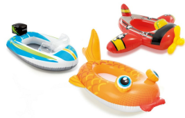
Intex Pool Cruiser Inflatable Baby Seat/Swim Boat (Assorted Model)

A general view of the Intex Pool Cruiser, showcasing its design as an inflatable baby seat or swim boat, available in assorted models.