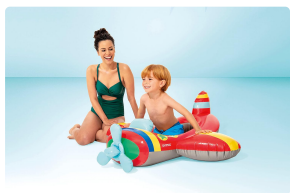
Child enjoying the Intex Pool Cruiser plane model

A child happily floating in the goldfish-shaped Intex Pool Cruiser, with an adult nearby for supervision.