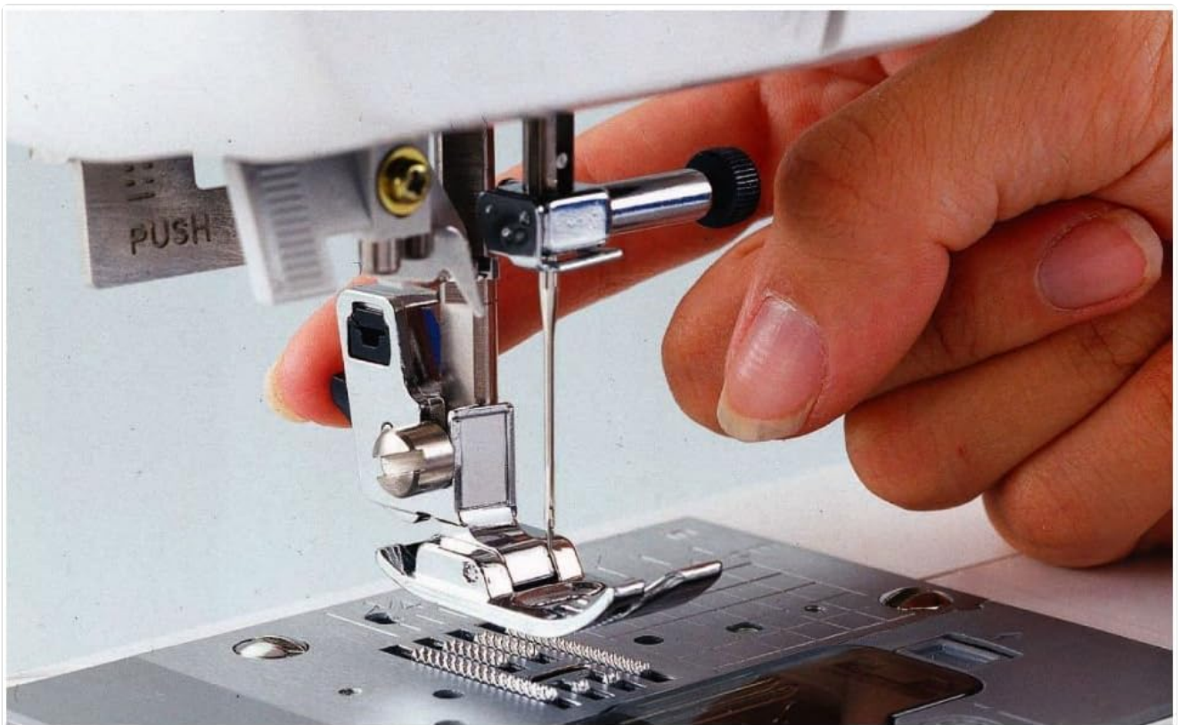
Figure 3: Utilizing the automatic needle threader for quick and easy threading of the needle.