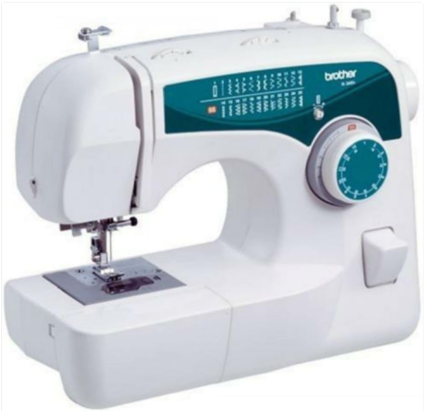
Figure 1: The Brother XL2600I Sewing Machine, a versatile and compact model suitable for various sewing tasks.