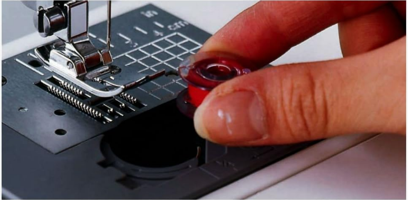
Figure 2: Installing the jam-resistant drop-in bobbin. This design helps prevent thread tangles during operation.