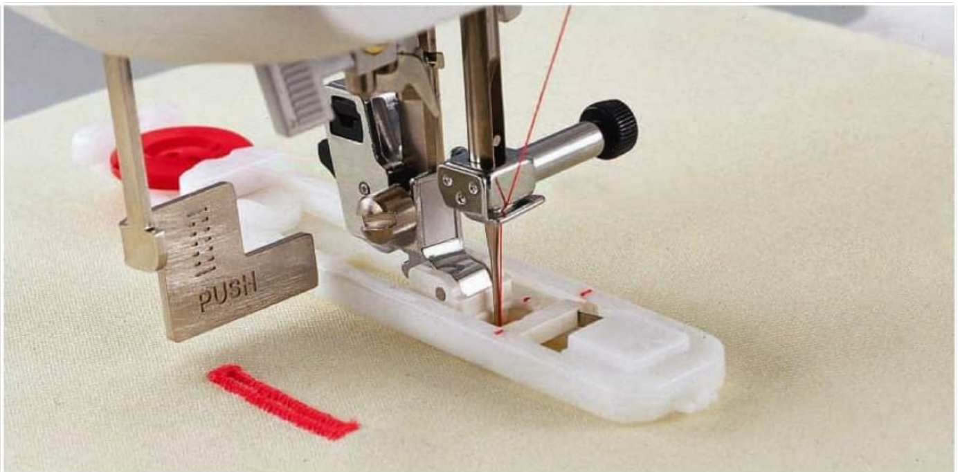
Figure 5: Demonstrating the 1-step auto-size buttonhole function, which simplifies the creation of perfectly sized buttonholes.