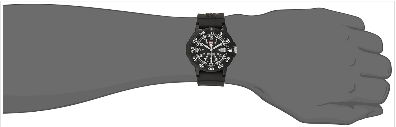
Figure 1: A clear front view of the Luminox Men's 3001 watch, highlighting the black dial, luminous markers, and unidirectional rotating bezel.