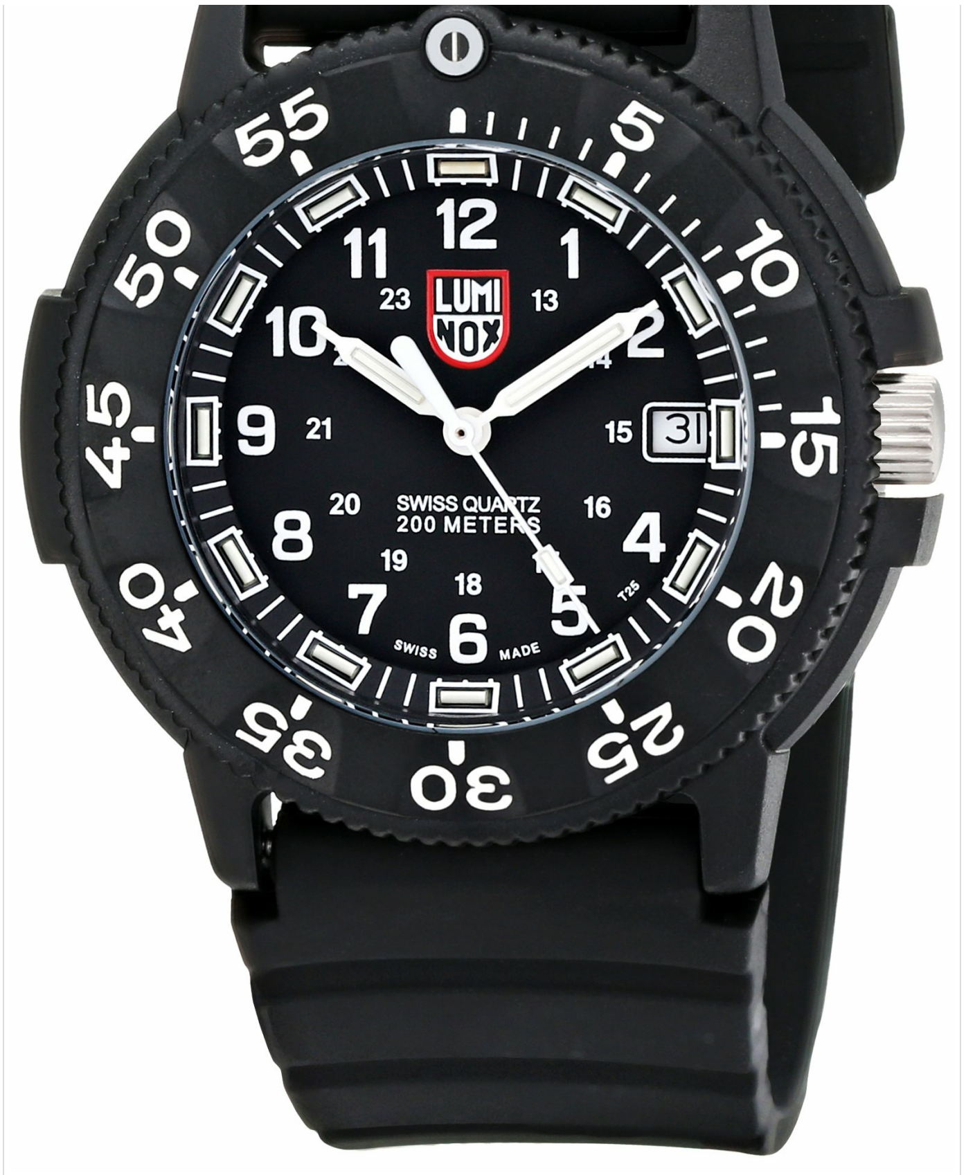
Figure 2: This image shows the Luminox Men's 3001 Quartz Navy Seal Dive Watch worn on a wrist, providing a perspective of its size and fit.