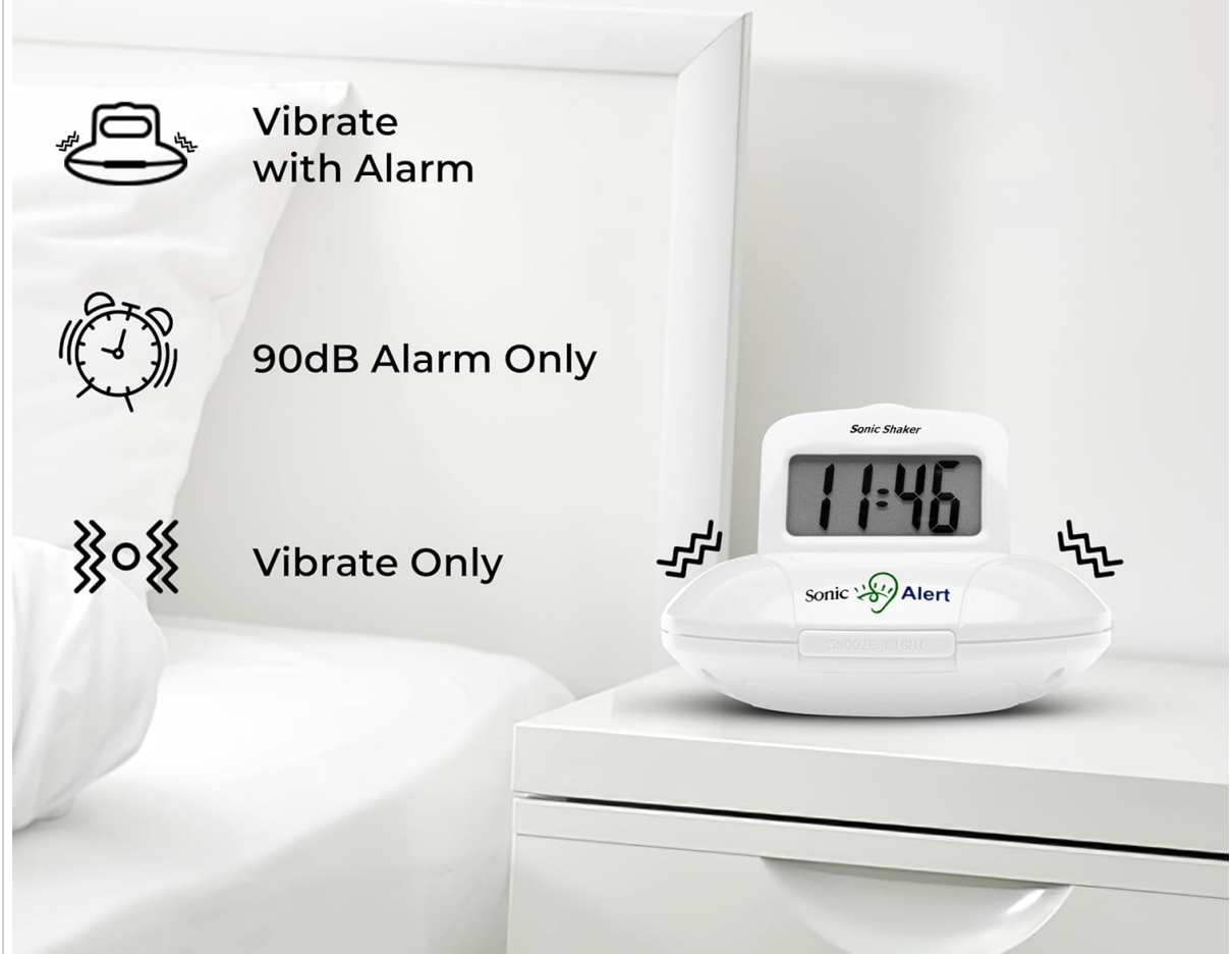
Image: Illustration of the three alarm modes available on the SBP100: vibration, audible alarm, or a combination of both.

The bed shaker is a bed vibrating unit that vibrates when the alarm goes off to ensure that everyone wakes up on time.