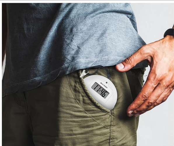
Clip to Pocket