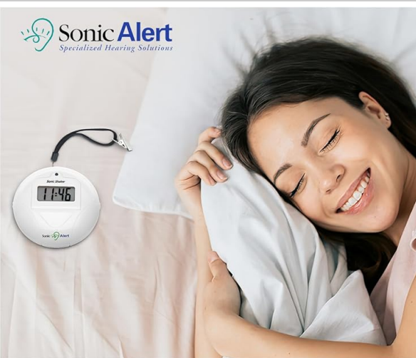
Clip to Pillow