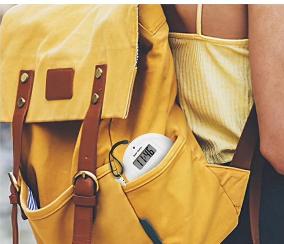
Clip to Backpack