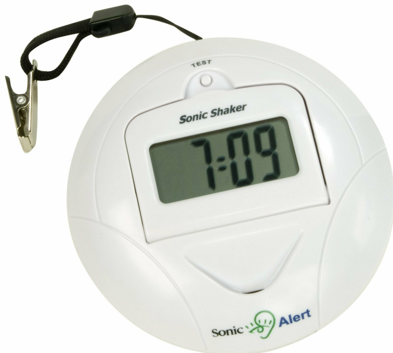
Image: The Sonic Alert SBP100 Portable Vibrating Alarm Clock in white, showing its compact design and digital display.

The Sonic Alert SBP100 Portable Vibrating Alarm Clock is designed to provide a reliable wake-up solution for individuals who are heavy sleepers, deaf, or hard of hearing, especially while traveling. This compact device features a powerful built-in vibrator, a loud audible alarm, and a clear digital display. Its portable design allows for use in various settings, ensuring you wake up on time for important events.