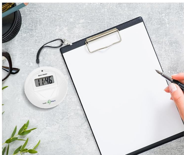
Clip to Clipboard

Image: Various ways to carry and secure the SBP100, including clipping it to a pillow, placing it in a pocket, attaching it to a backpack, or using it on a clipboard.