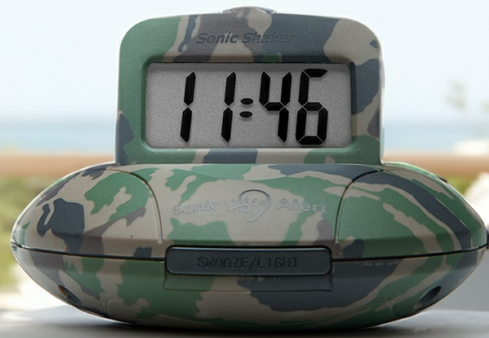
Image: The Sonic Alert SBP100 positioned under a pillow, secured by its strap, for silent vibrating alarm.