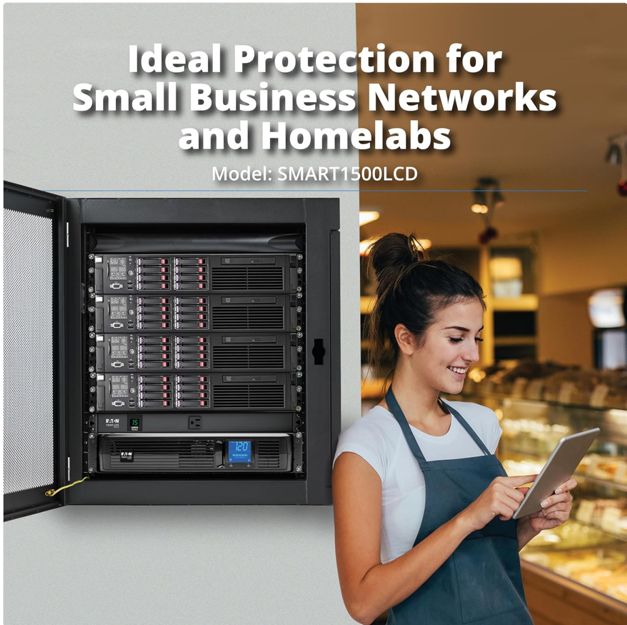
Image: Tripp Lite SMART1500LCD UPS installed in a server rack. The image shows the UPS unit mounted horizontally within a standard server rack, demonstrating its rackmount capability.