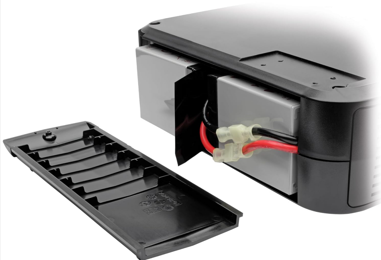
UPS backup battery replacement RBC1500 sold separately.

Image: Tripp Lite SMART1500LCD UPS with battery compartment open showing replaceable batteries. The image illustrates the ease of access to the internal batteries for replacement, emphasizing their field-replaceable and hot-swappable nature.