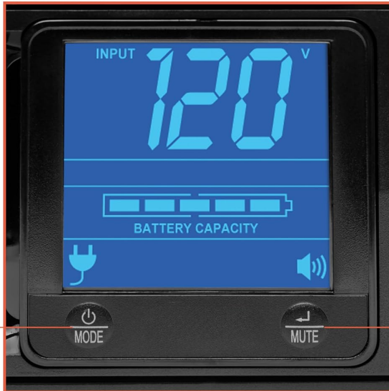
Image: Tripp Lite SMART1500LCD UPS with vertical mount adapter. This image illustrates the UPS unit standing vertically with its base brackets, and a close-up shows the rotatable LCD panel for proper viewing in this orientation.