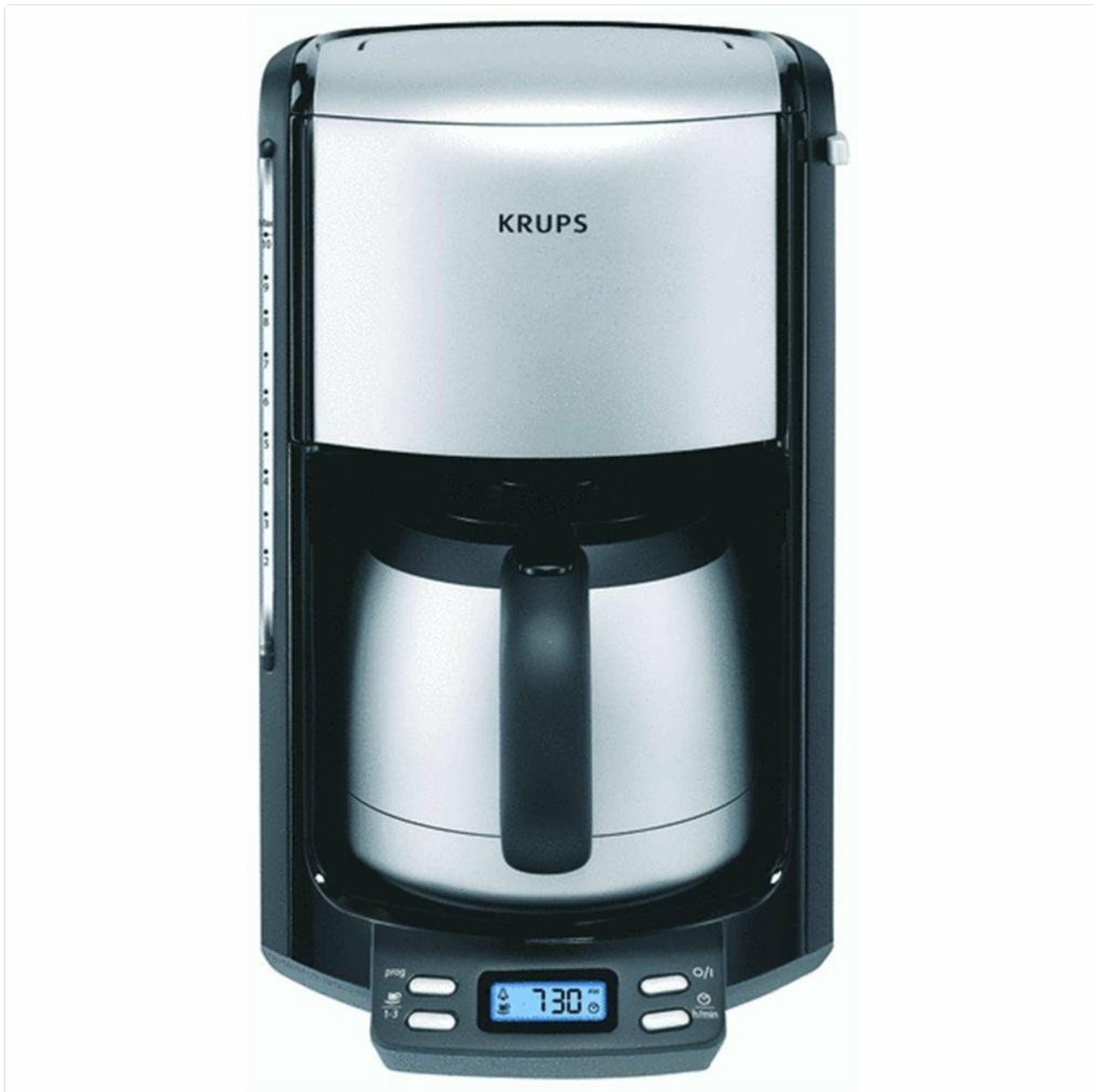
Image 3.1: An illustration of the KRUPS FMF5 coffee maker highlighting its main components such as the control panel, water reservoir, filter holder, and thermal carafe.