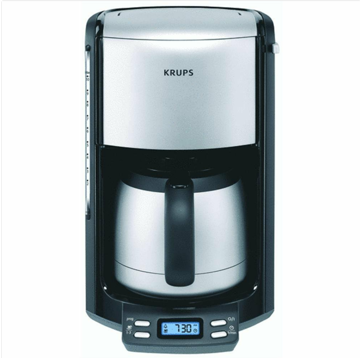
Image 6.1: A close-up view of the KRUPS FMF5 control panel, showing the LCD display and buttons for On/Off, Clock, Timer, and Aroma settings.