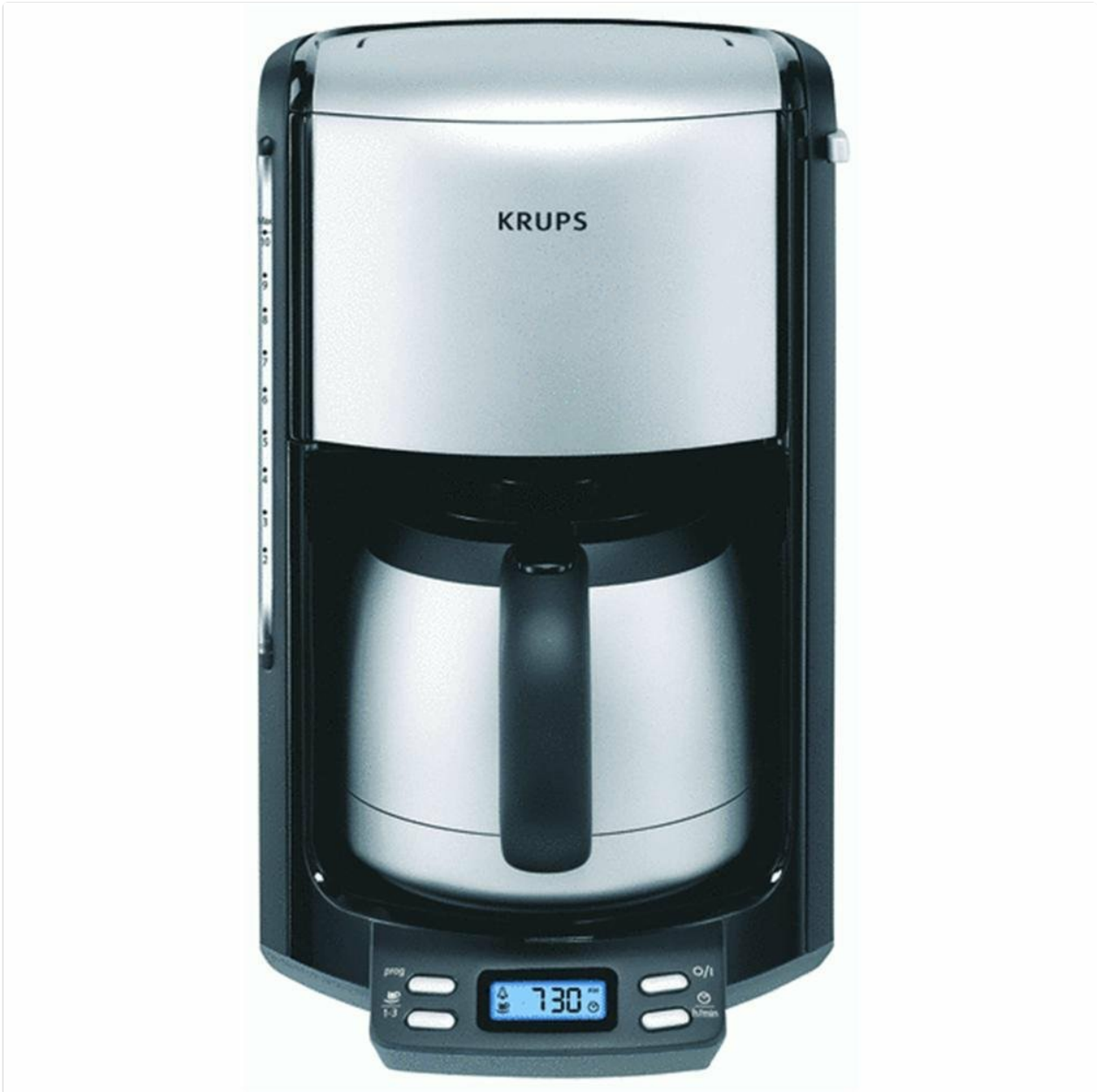
Image 7.2: Illustrates the water reservoir filled with a descaling solution. Regular descaling is essential for maintaining the coffee maker's performance and coffee quality.