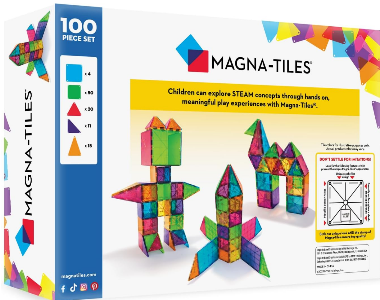
Image: Back of the MAGNA-TILES 100-piece set box, detailing the quantity and types of shapes included in the set.