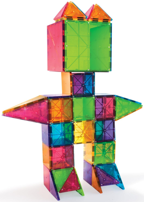
Image: A humanoid figure constructed from MAGNA-TILES, showcasing imaginative character building.