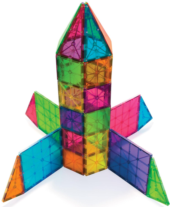
Image: A rocket ship built with MAGNA-TILES, illustrating vertical construction and creative design.