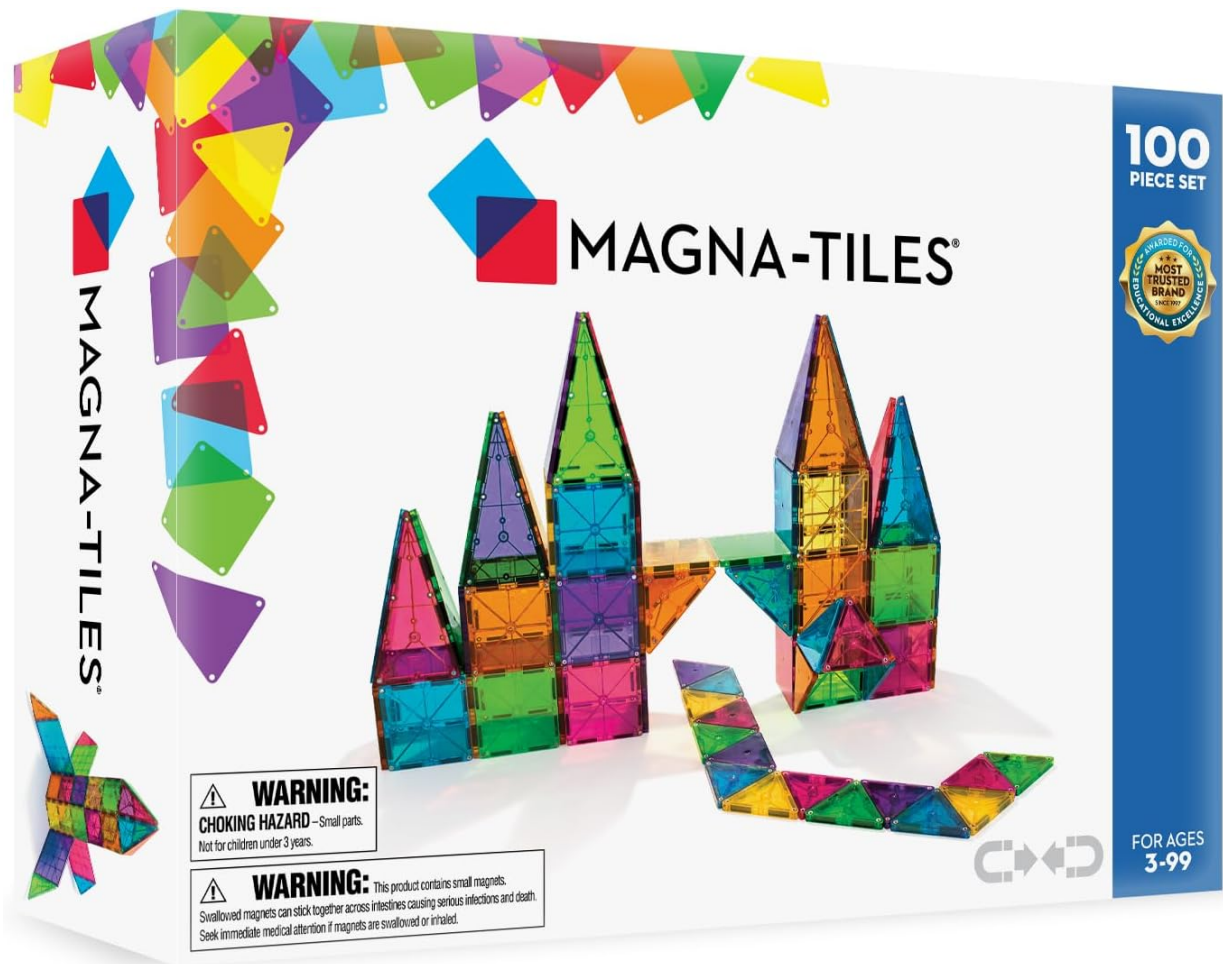
Image: Front view of the MAGNA-TILES Classic 100-Piece Magnetic Construction Set box, showcasing colorful magnetic tiles forming a castle and other shapes.