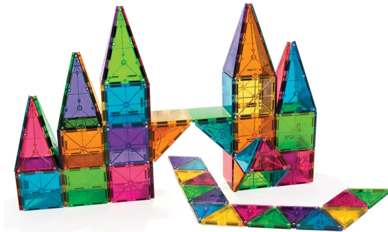
Image: A vibrant castle structure built using various MAGNA-TILES shapes, demonstrating complex building possibilities.