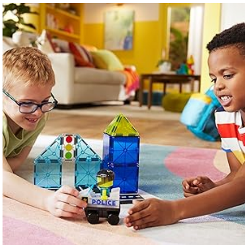
Image: Two children collaboratively playing with MAGNA-TILES, building structures around a toy car, illustrating cooperative play.