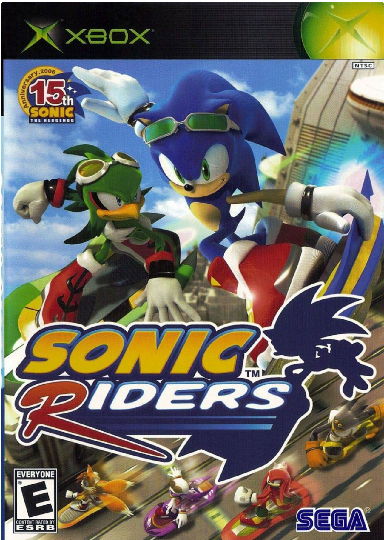
Image 1.1: Front cover of the Sonic Riders game for Xbox, showing Sonic and Jet the Hawk racing on their Extreme Gear.

The game features a diverse cast of characters, each with distinct talents in speed, power, or flight, influencing their performance on the tracks. Players can engage in a Story mode to uncover the mystery behind Dr. Eggman's World Grand Prix and the new rival group, the Babylon Rogues. Additionally, the game offers extensive customization options for Extreme Gear and supports multiplayer battles for up to four players.