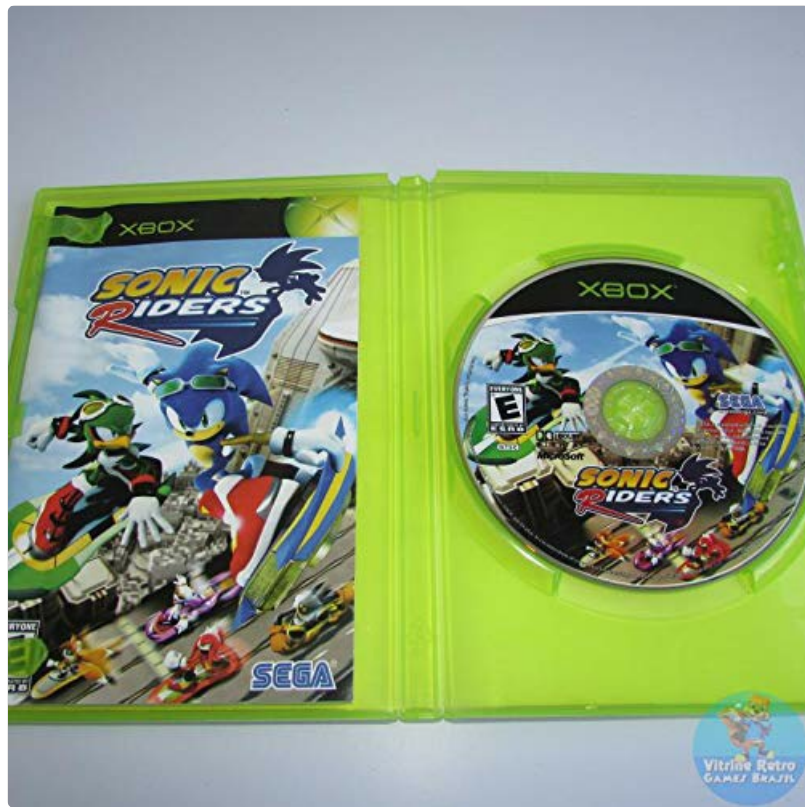
Image 2.2: The Sonic Riders game disc shown within its Xbox case, ready for insertion into the console.