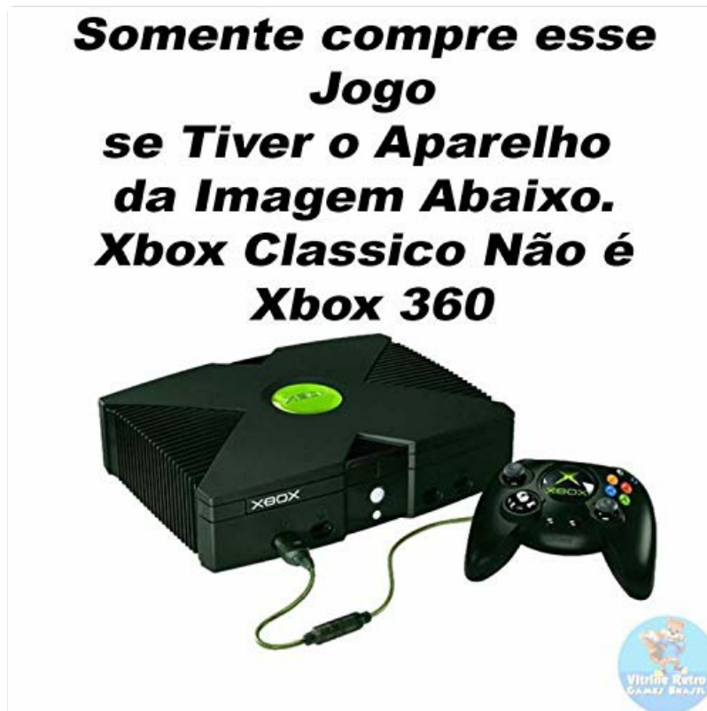
Image 2.1: An original Xbox console with its controller, illustrating the required hardware for playing Sonic Riders.