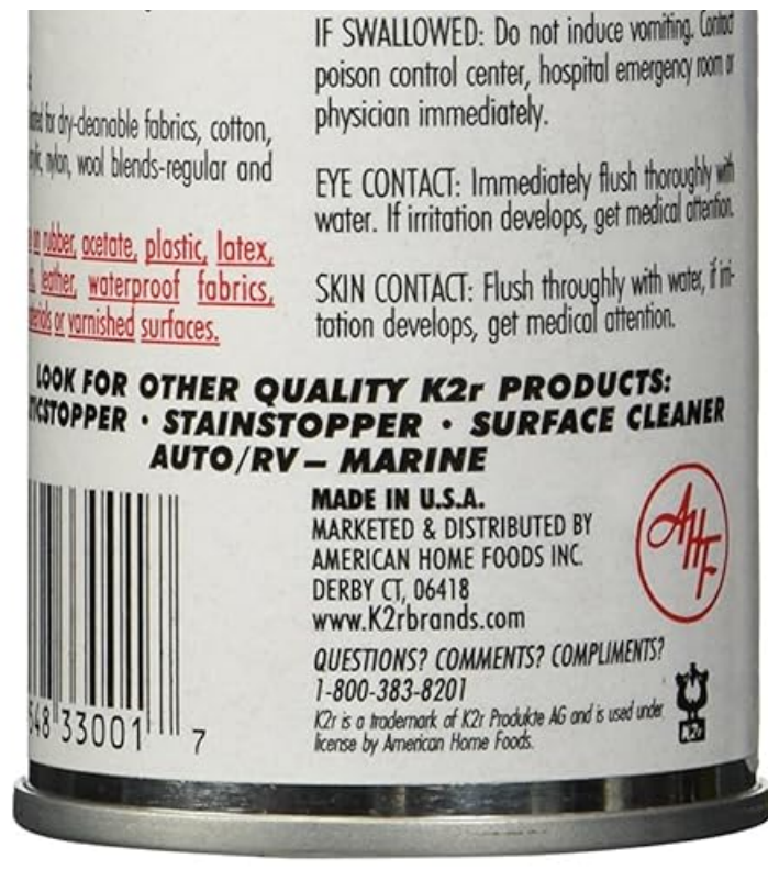
Image: Back of K2r Spot Remover can. This view displays detailed safety warnings, first aid instructions, and usage guidelines printed on the product label.