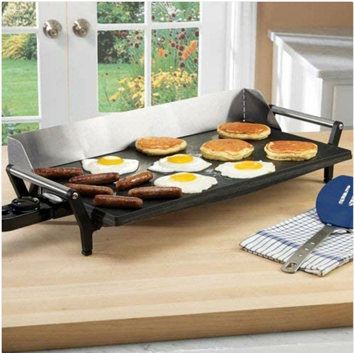
Image: Another view of the Broil King PCG-10 griddle cooking breakfast, featuring sausages, fried eggs, and pancakes.