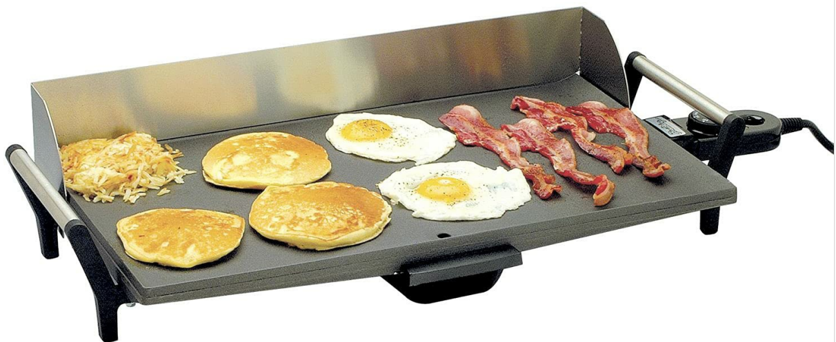
Image: The Broil King PCG-10 griddle in use, cooking a variety of breakfast items including pancakes, bacon, and fried eggs, demonstrating its large cooking surface.