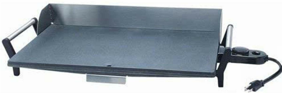
Image: The Broil King PCG-10 Professional Portable Nonstick Griddle with its backsplash and temperature probe connected, ready for use on a kitchen counter.