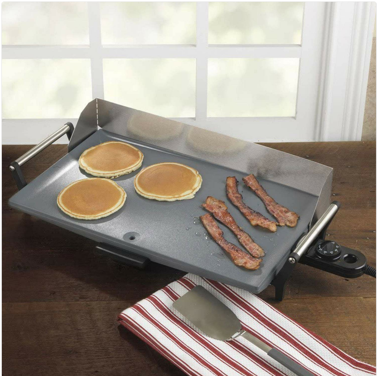
Image: The Broil King PCG-10 griddle cooking crispy bacon and golden pancakes.

Your browser does not support the video tag.