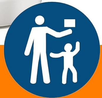
Image 2: Illustration of various button cell batteries with a warning about ingestion hazard and keeping them away from children.