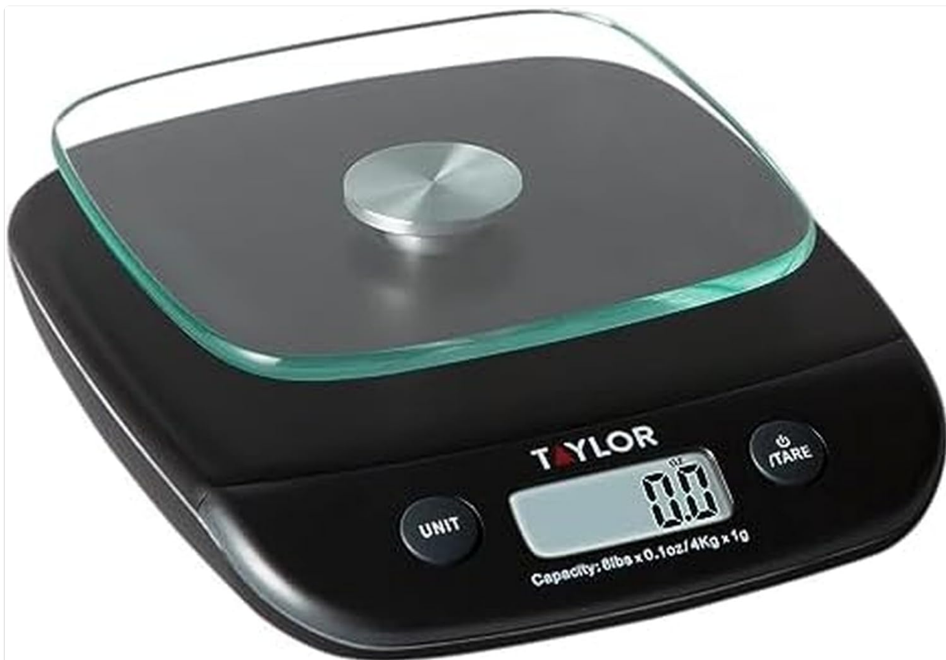
Image 1: Taylor Digital Kitchen Scale Model 3800N. This image shows the black scale with its clear tempered glass weighing platform and digital display.

This manual provides detailed instructions for the proper use and care of your Taylor Digital Kitchen Scale Model 3800N. Designed for precision, this scale accurately weighs food and household items up to 8 pounds 13 ounces (4 kilograms) in 0.1 oz / 1 g increments. It features a tempered glass platform, a clear LCD readout, and a convenient tare function.