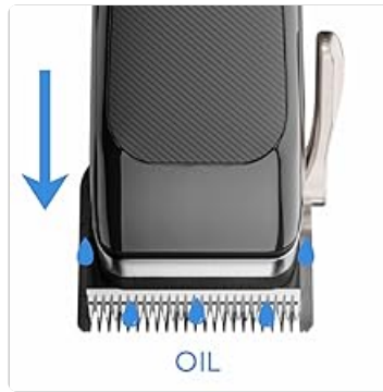
Figure 5: Oiling Clipper Blades.

To ensure optimal performance and longevity of your trimmer, apply a few drops of clipper oil to the blades before and after each use. This lubricates the blades, reduces friction, and prevents rust.