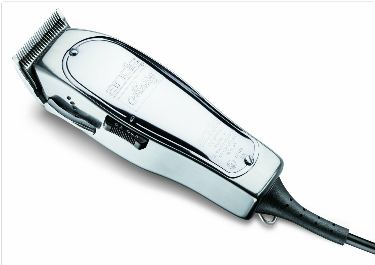
Figure 1: Andis 01557 Professional Master Adjustable Blade Hair Trimmer.

This image displays the complete Andis 01557 Professional Master Hair Trimmer, highlighting its sleek silver and chrome design. The robust aluminum casing and adjustable blade lever are visible, emphasizing its professional-grade construction.