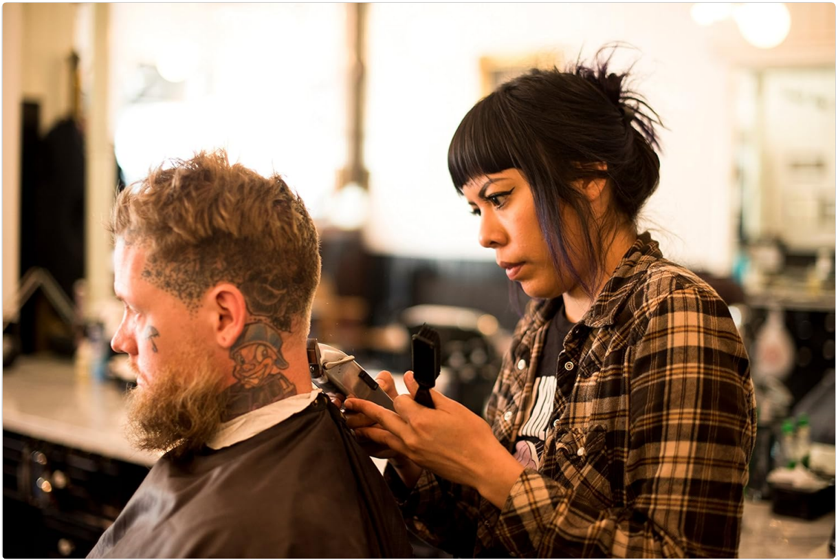
Figure 3: Trimmer in Use for Neckline.

This image shows a professional barber using the Andis Master Trimmer to refine the neckline of a client. The trimmer's compact design allows for precise control and clean lines, demonstrating its effectiveness in detailed grooming.