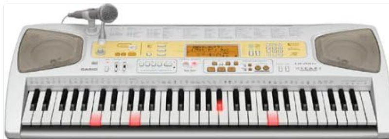
Image: The CASIO LK-201TV electronic keyboard, featuring 61 keys, a central LCD display, control buttons, built-in speakers on either side, and a microphone connected to the top left. Several keys on the keyboard are illuminated in red, indicating the light-up key function.

This manual provides essential information on setting up, operating, and maintaining your LK-201TV keyboard. Please read it thoroughly before use to ensure proper operation and to maximize your enjoyment of the product.