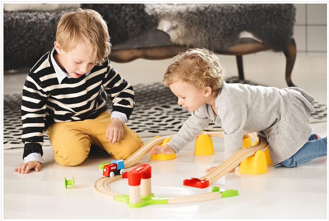
Image: Two children, a boy and a girl, are shown playing together with the BRIO World 33710 train set on the floor, demonstrating interactive play.