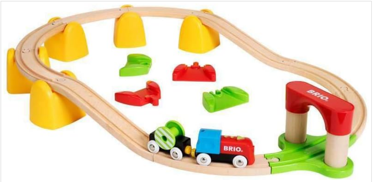
Image: An overhead view of the assembled BRIO World 33710 train set, showcasing the track layout with elevated sections and the train on the tracks.