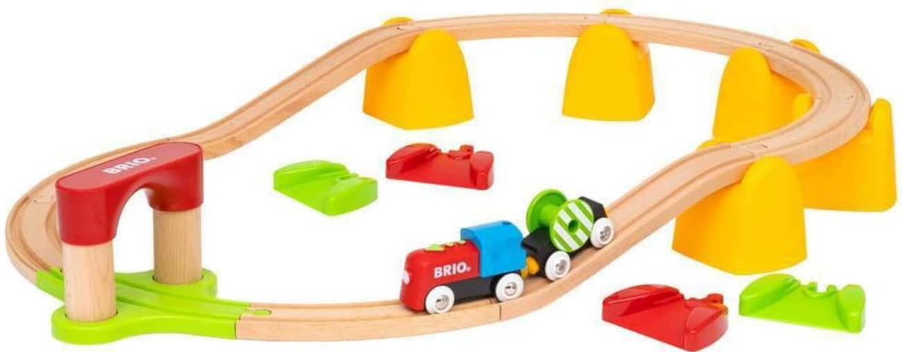
Image: The BRIO World 33710 set, showing the packaging and all included components laid out, including the train, wagon, tracks, ramps, and stacking curve.