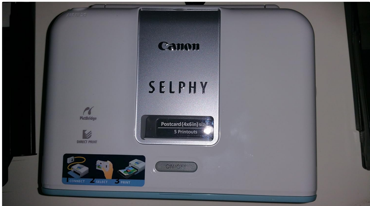
Image: Top view of the Canon SELPHY CP510 printer, illustrating the main unit and control area.

Important: Do not overfill the paper tray. Overfilling can cause stress on the internal gears and lead to paper jams or printer malfunctions.