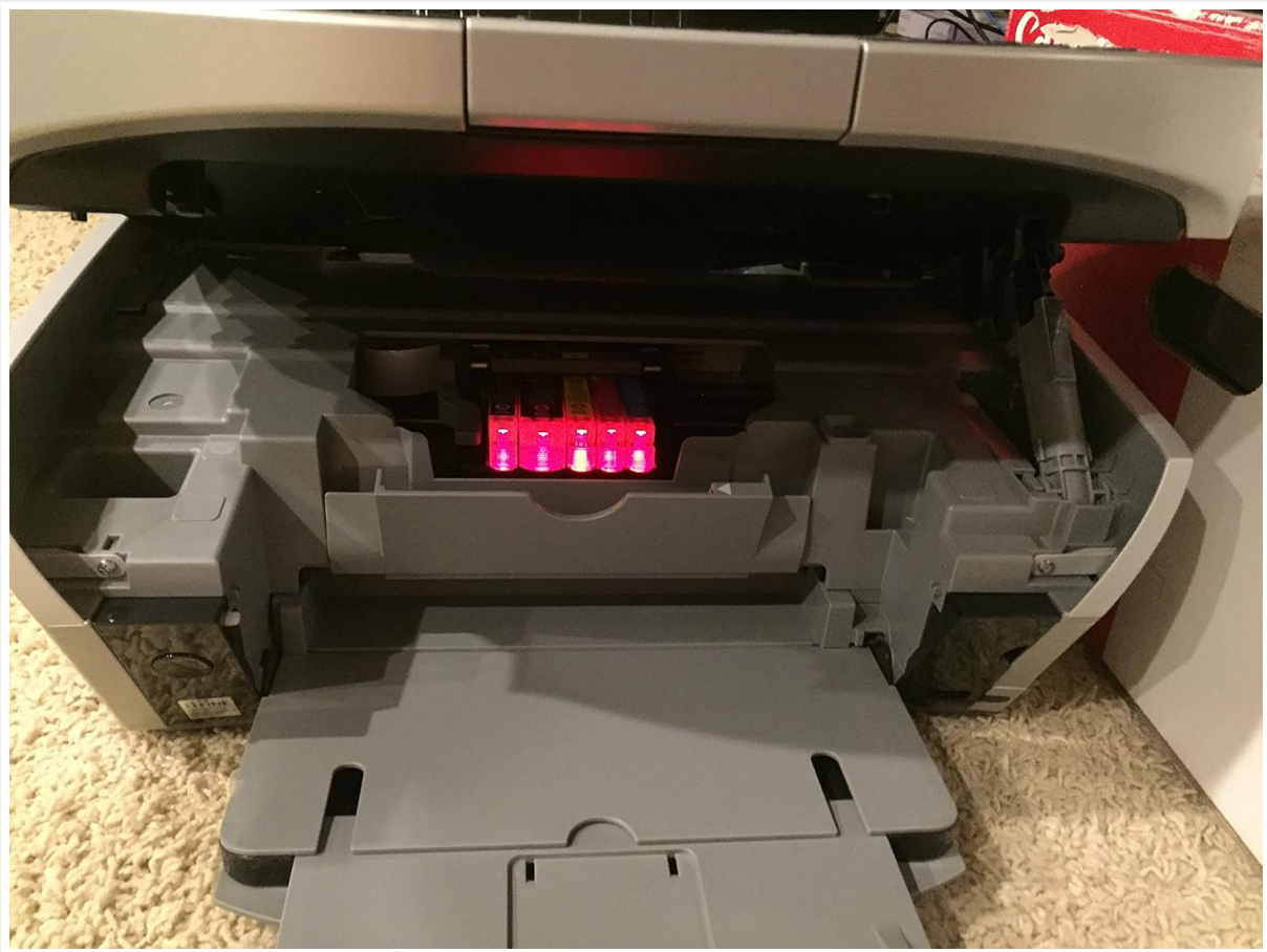
Figure 6.2: An internal view of the printer, showing the print head carriage with all five ink cartridges correctly installed and illuminated.