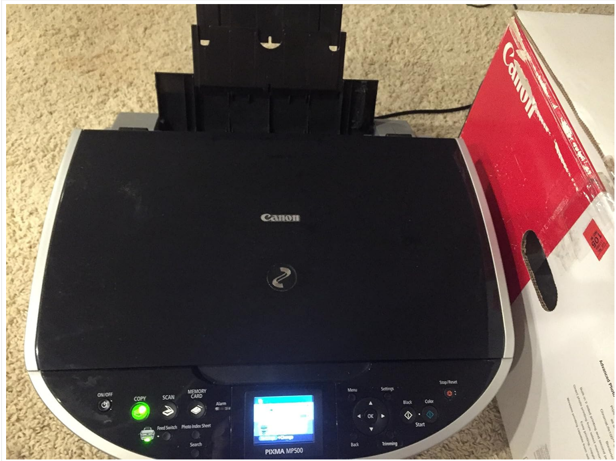
Figure 5.1: The top view of the printer, featuring the control panel with various buttons and the integrated 2.5-inch color LCD screen.