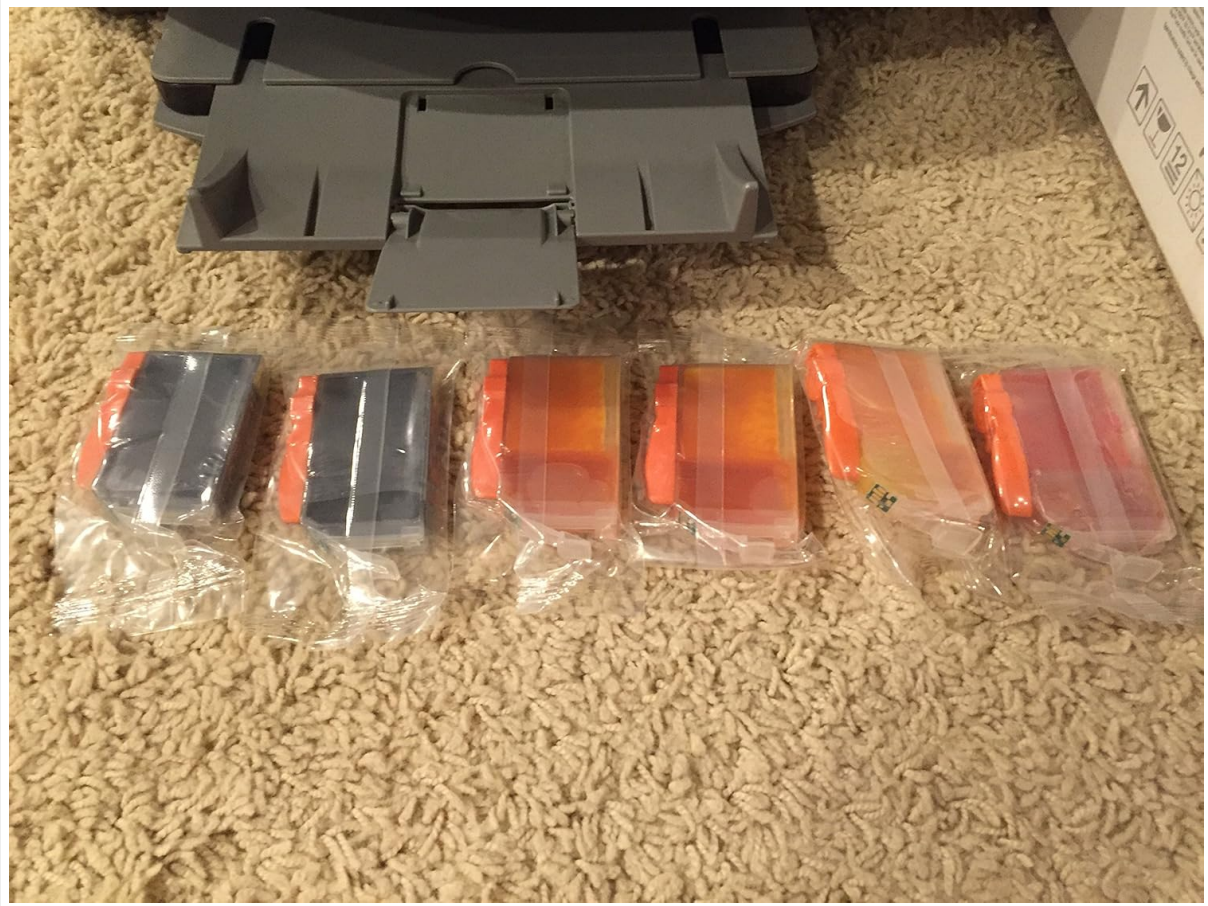
Figure 6.1: A close-up view of the individual ink cartridges used by the PIXMA MP500, showing their distinct colors.