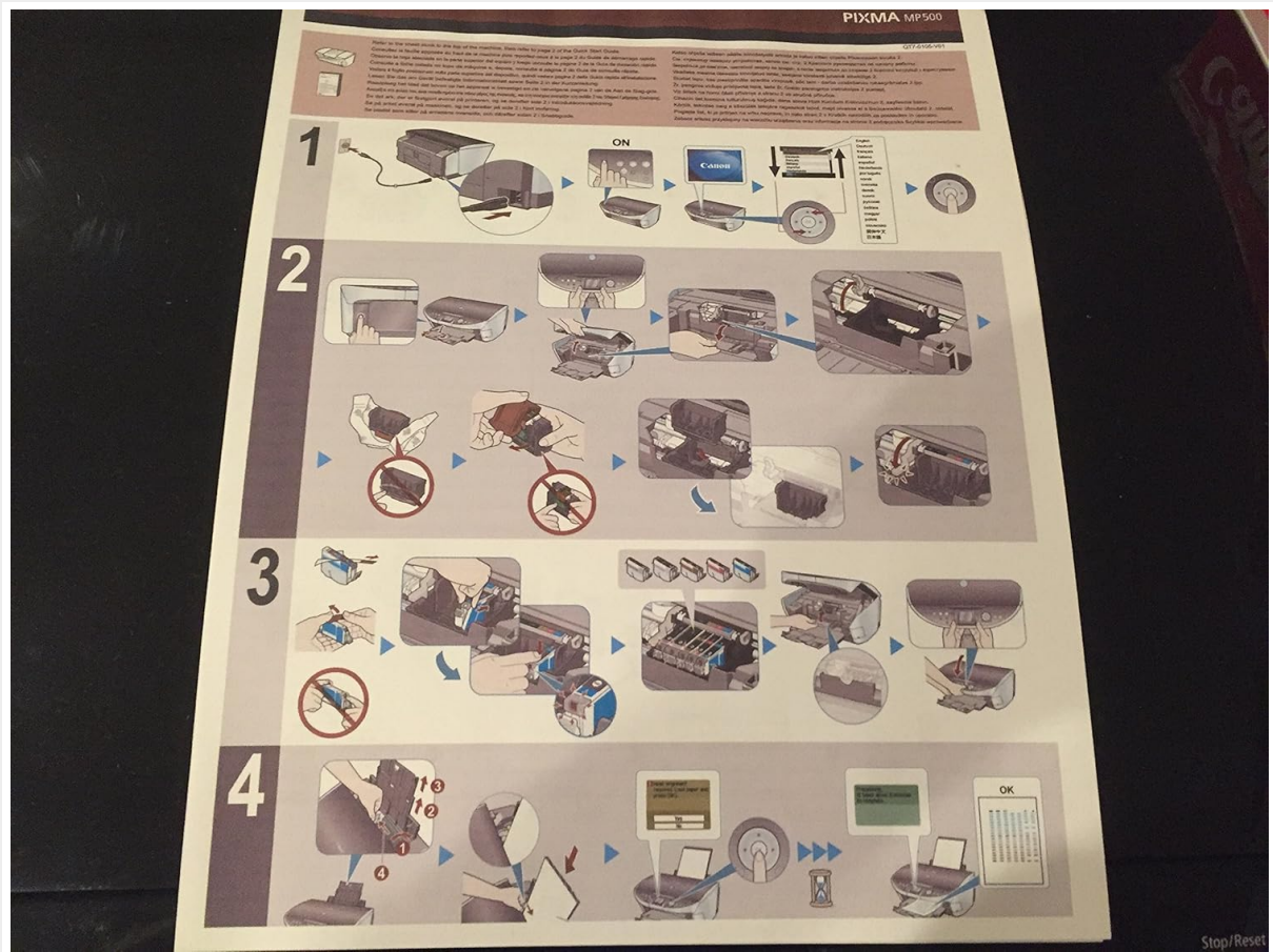
Figure 4.1: A visual quick setup guide illustrating the initial steps for connecting power, installing ink, and setting up the printer.