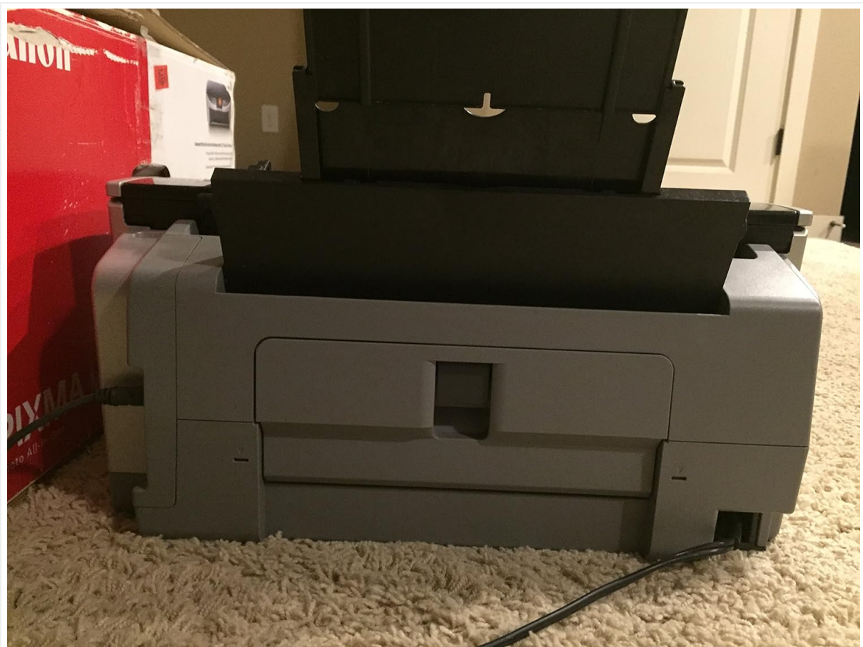
Figure 4.2: The rear panel of the printer, highlighting the power input and USB connection port.