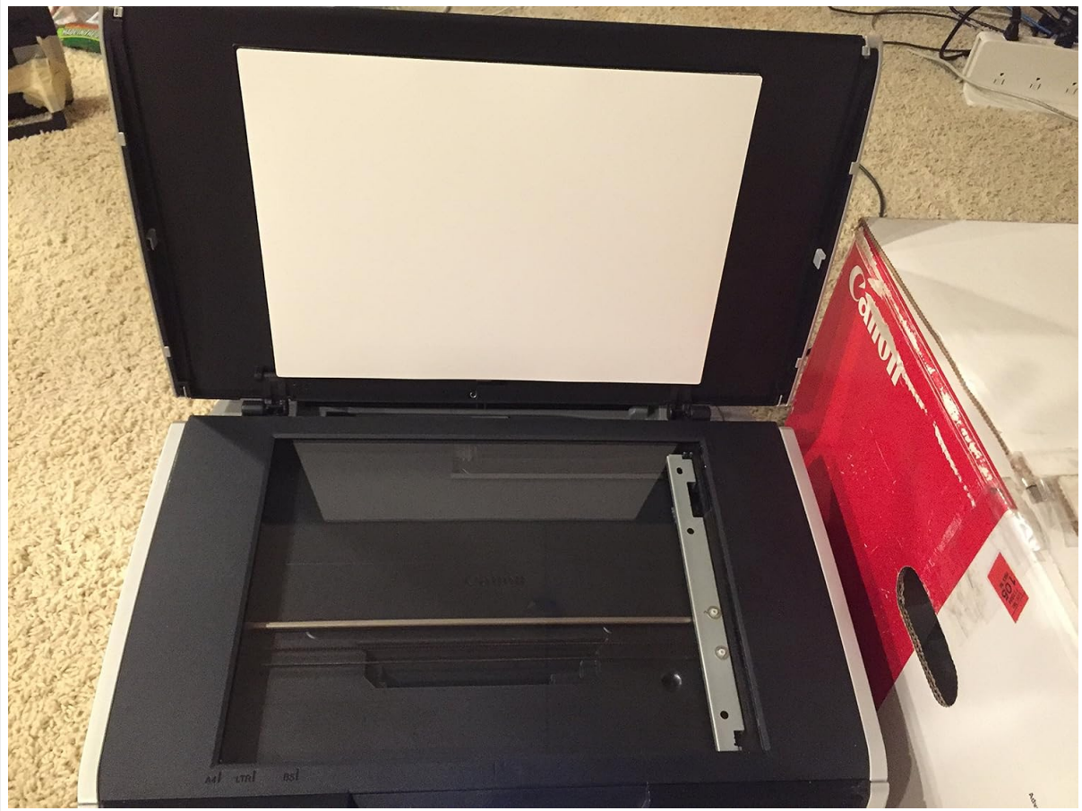
Figure 5.3: The scanner bed of the PIXMA MP500 with the document cover open, ready for placing documents or photos.