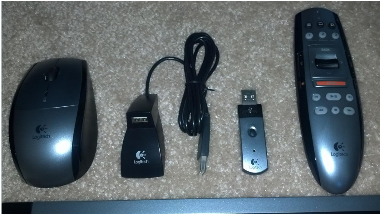
Image 1: Logitech Cordless Desktop S 510 Media Remote components including the mouse, USB receiver, USB extension cable, and media remote.