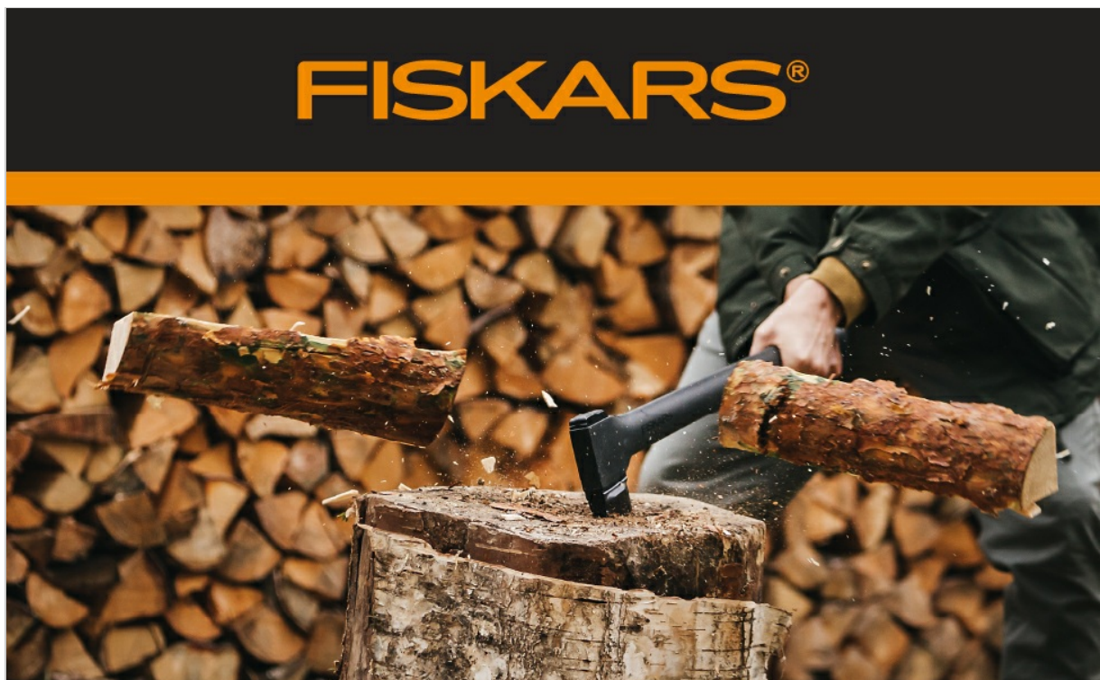
Figure 3: Demonstrating proper technique for splitting wood with the Fiskars X11 axe.