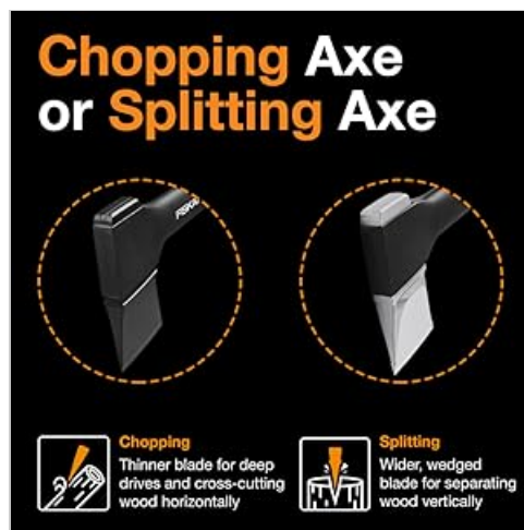
Figure 5: Understanding the difference between a chopping axe (thinner blade for horizontal cuts) and a splitting axe (wider, wedged blade for vertical splitting). The X11 is a splitting axe.