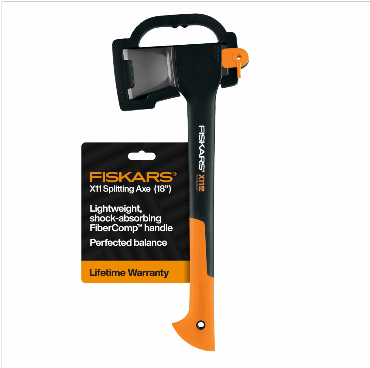
Figure 1: Fiskars X11 Splitting Axe with its protective sheath.