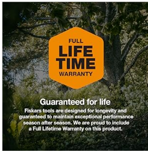
Figure 8: Fiskars provides a Lifetime Warranty on this product, ensuring lasting quality and performance.