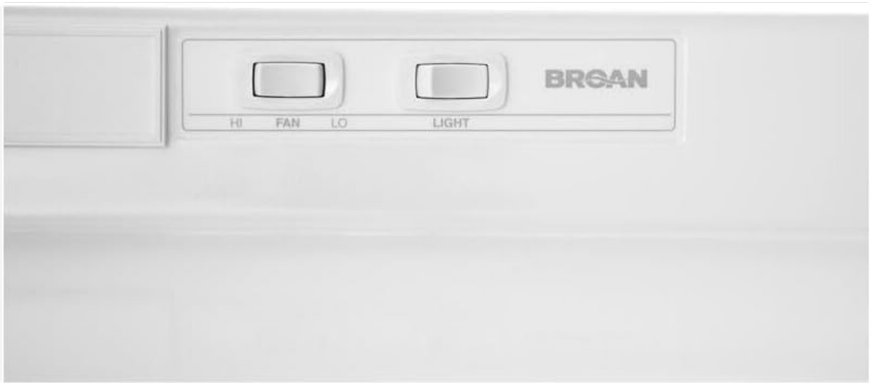
Figure 4: Control panel with rocker switches for fan (High/Low) and light (On/Off).