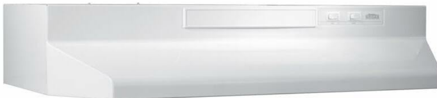
Figure 1: Broan-NuTone F403011 30-Inch Under Cabinet Range Hood, White on White.

The Broan-NuTone F403011 is a versatile 30-inch under cabinet range hood designed to provide efficient ventilation and lighting for your kitchen. This convertible unit can be installed for ducted or non-ducted operation, offering flexibility to suit various kitchen layouts. It features a two-speed fan and integrated lighting to enhance your cooking experience.