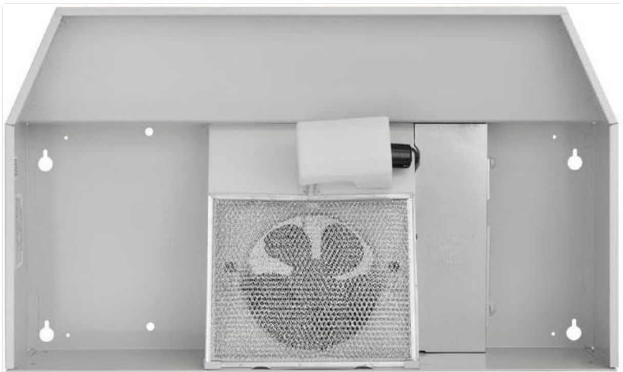
Figure 5: Underside view of the range hood, highlighting the fan and removable grease filter.