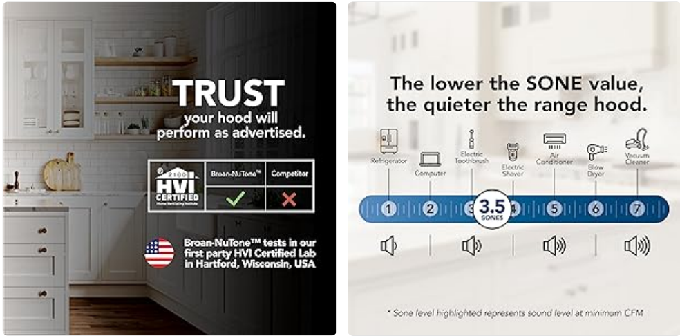
Figure 6: HVI Certified logo and Sone level comparison for noise reference.