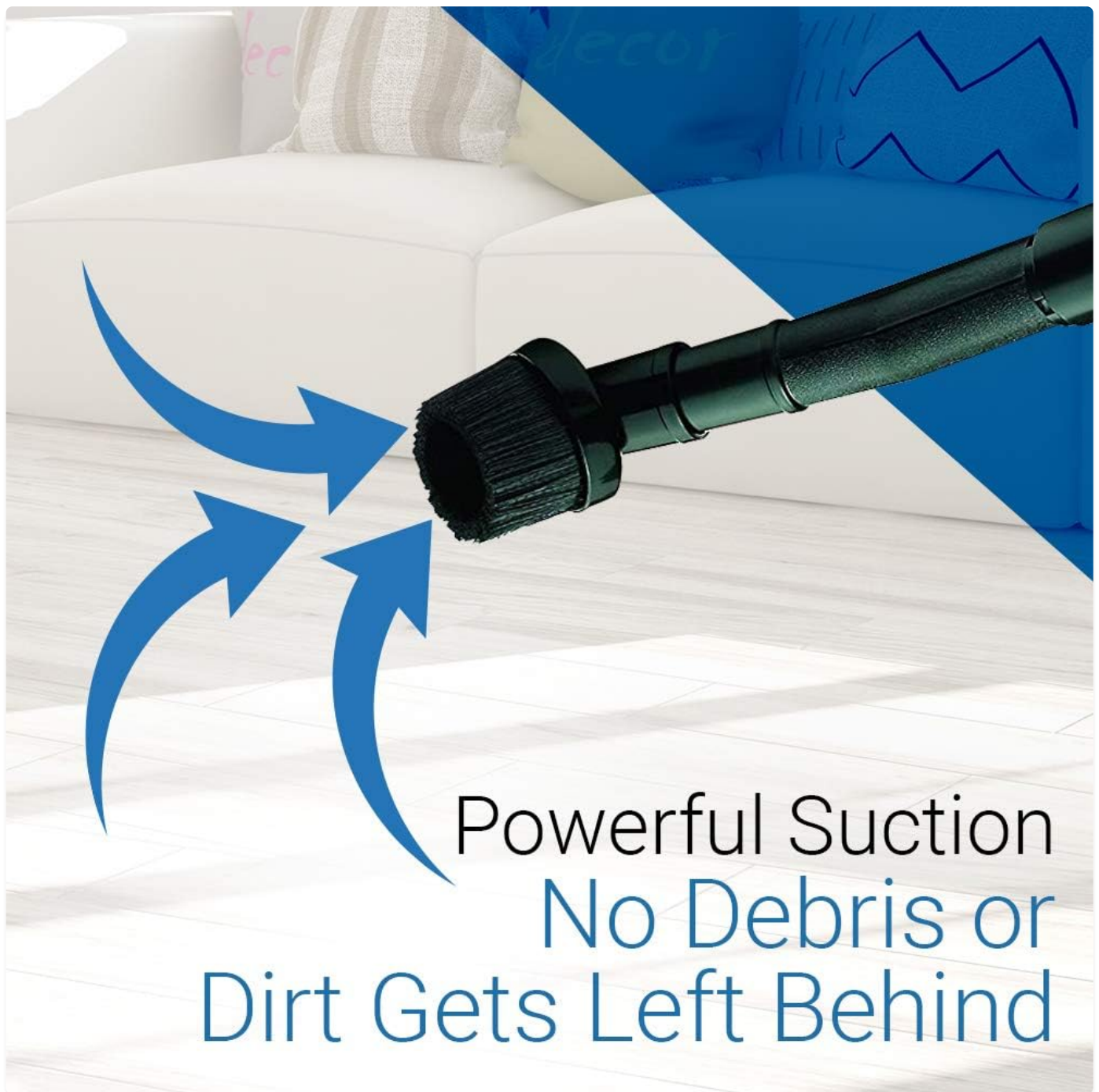
Figure 6: The powerful suction of the Oreck Super-Deluxe ensures thorough cleaning, leaving no debris or dirt behind.