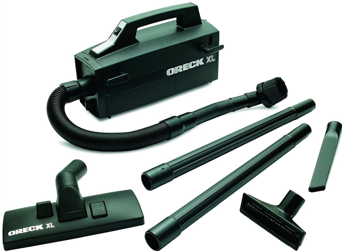
Figure 2: All components of the Oreck Super-Deluxe Compact Canister Vacuum Cleaner, including the main unit, flexible hose, extension wands, and various cleaning attachments.

bag compartment. Refer to the compartment's markings for proper alignment.