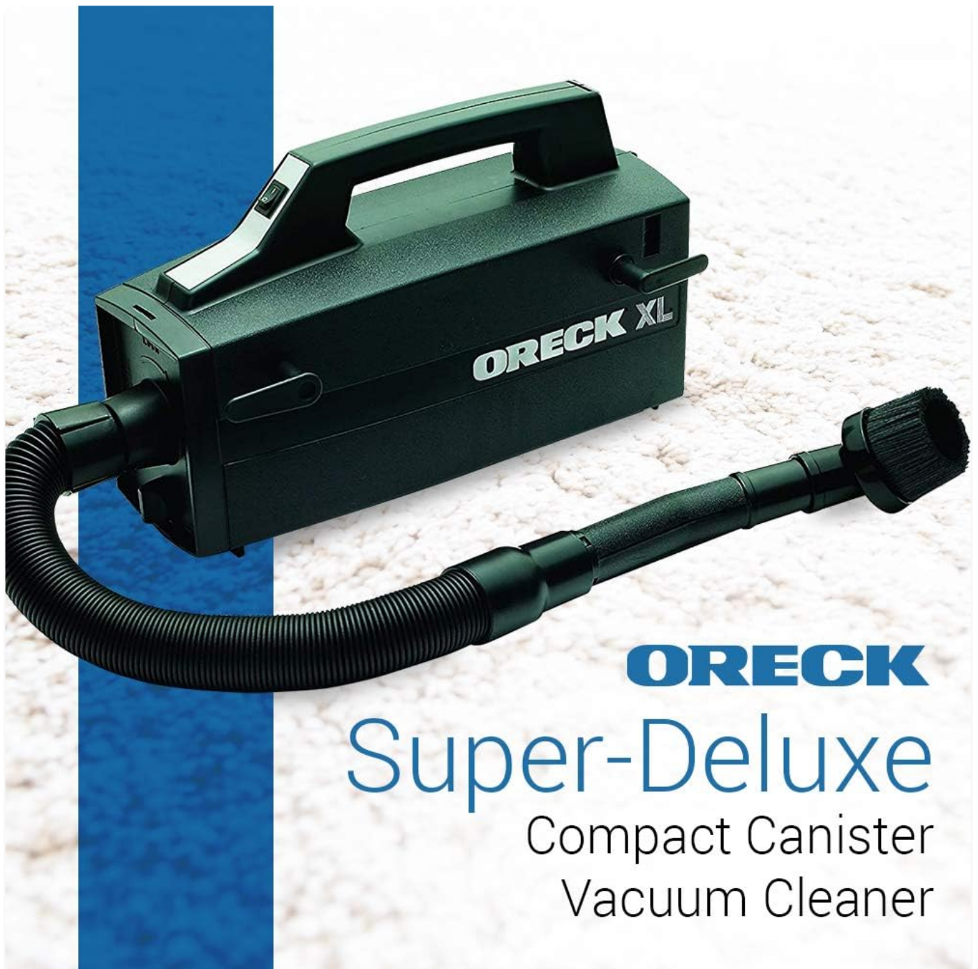
Figure 1: Oreck Super-Deluxe Compact Canister Vacuum Cleaner.