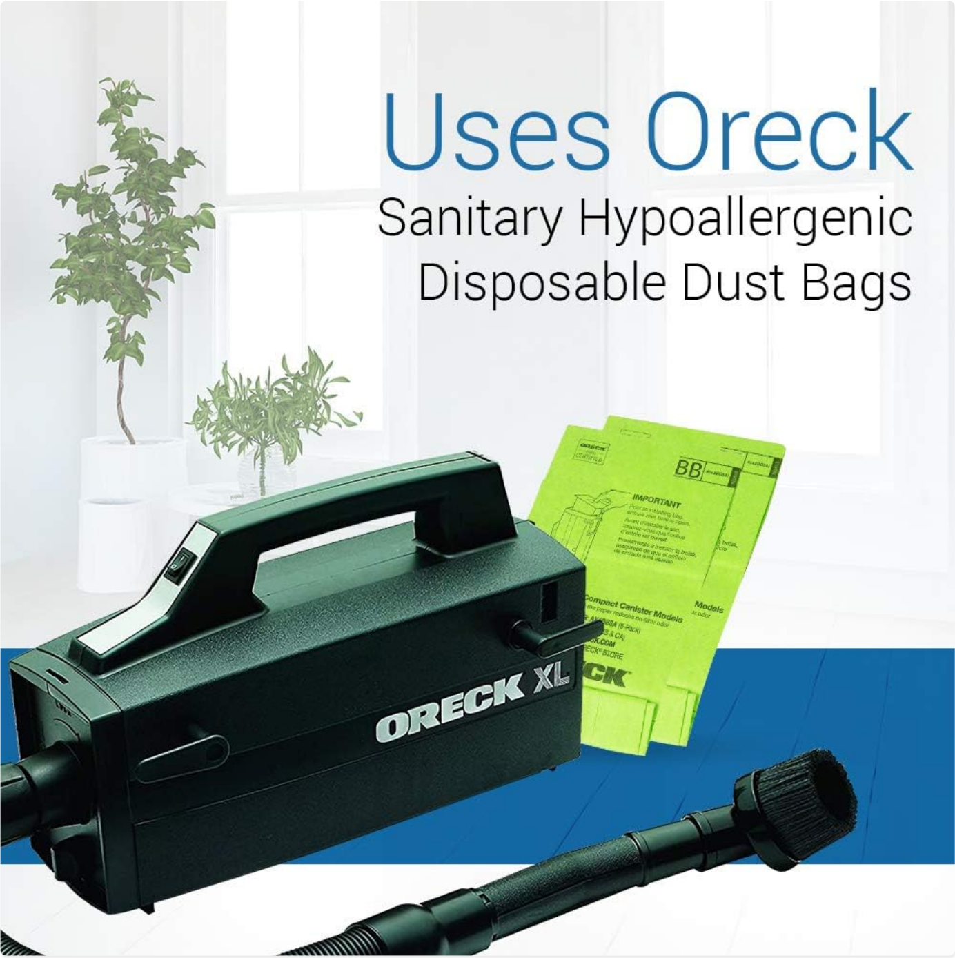
Figure 7: The Oreck Super-Deluxe uses sanitary hypoallergenic disposable dust bags, simplifying the disposal of collected debris.