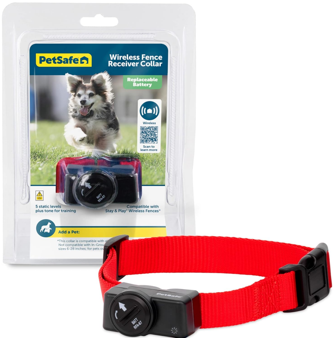
Image: The PetSafe Wireless Fence Receiver Collar shown in its retail packaging and as a standalone unit, highlighting its compact design and the red adjustable strap.