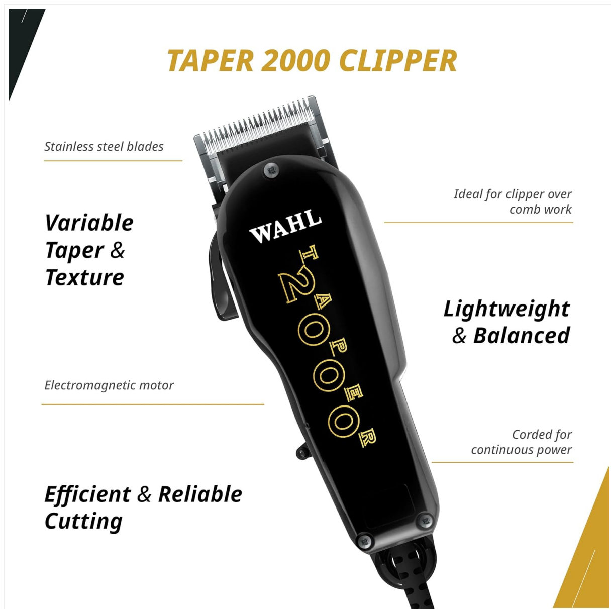
Image: The Wahl Taper 2000 Clipper highlighting its stainless steel blades, variable taper and texture, electromagnetic motor, lightweight and balanced design, and corded power.