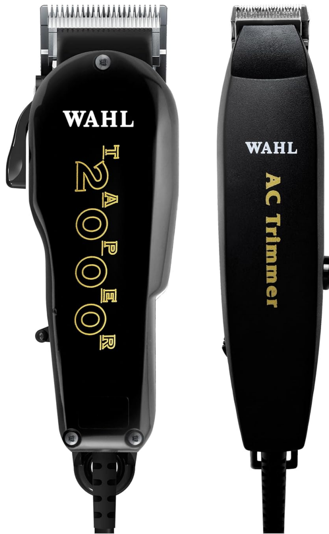
Image: The Wahl Professional Essentials Corded Combo, including the Taper 2000 Clipper and AC Trimmer.