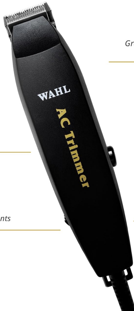
Image: The Wahl AC Trimmer highlighting its scoop nose design, electromagnetic motor, and durability, suitable for outlining around the face, ears, and neck.