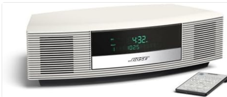
Figure 3: Bose Wave Radio II with its remote control.