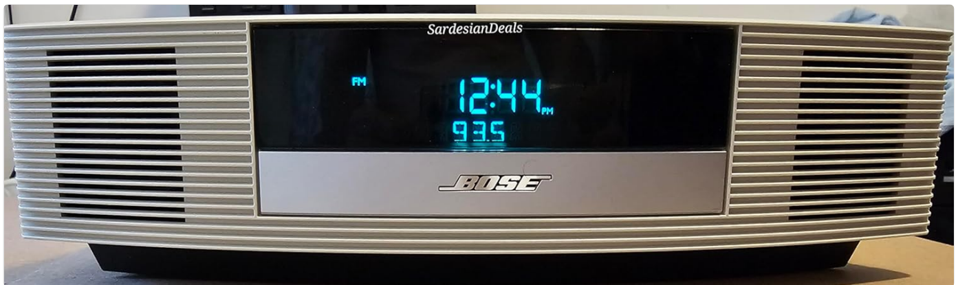
Figure 1: Front view of the Bose Wave Radio II, showcasing its display and speaker grilles.

The Bose Wave Radio II is designed to provide rich, room-filling sound from a compact system. Utilizing Bose's acoustic waveguide speaker technology, it delivers clear stereo sound and natural tonal balance across all volume levels. This manual provides essential information for setting up, operating, maintaining, and troubleshooting your Wave Radio II.