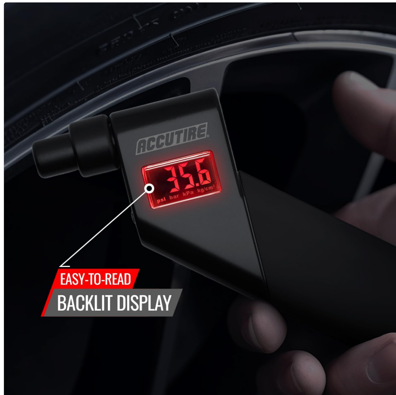
Image: The Accutire MS-4021B in use, demonstrating its easy-to-read backlit display showing a pressure reading.