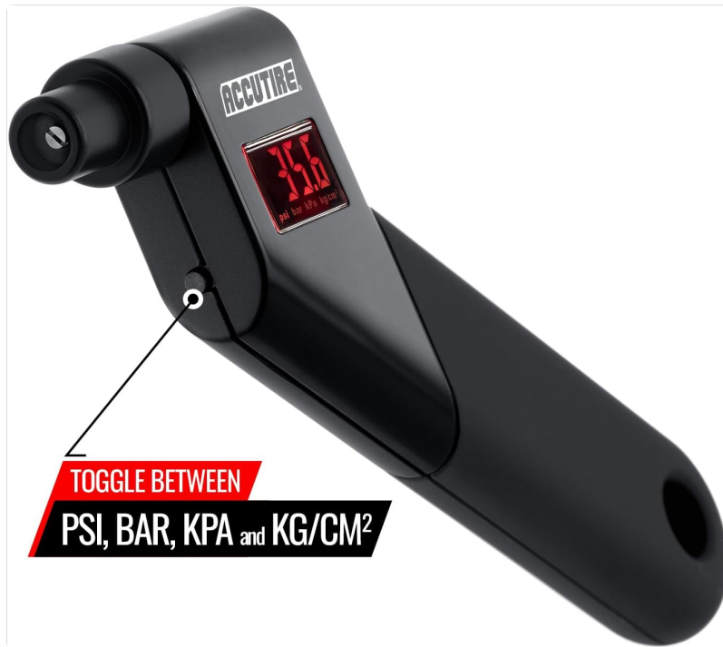
Image: The Accutire MS-4021B with an arrow pointing to the small button used to toggle between PSI, BAR, KPA, and KG/CM 2 units.