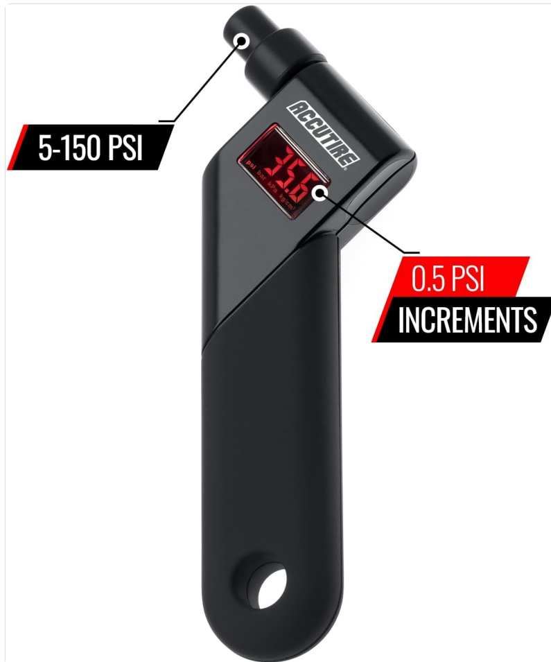
Image: The Accutire MS-4021B highlighting its measurement range of 5-150 PSI and 0.5 PSI increments.