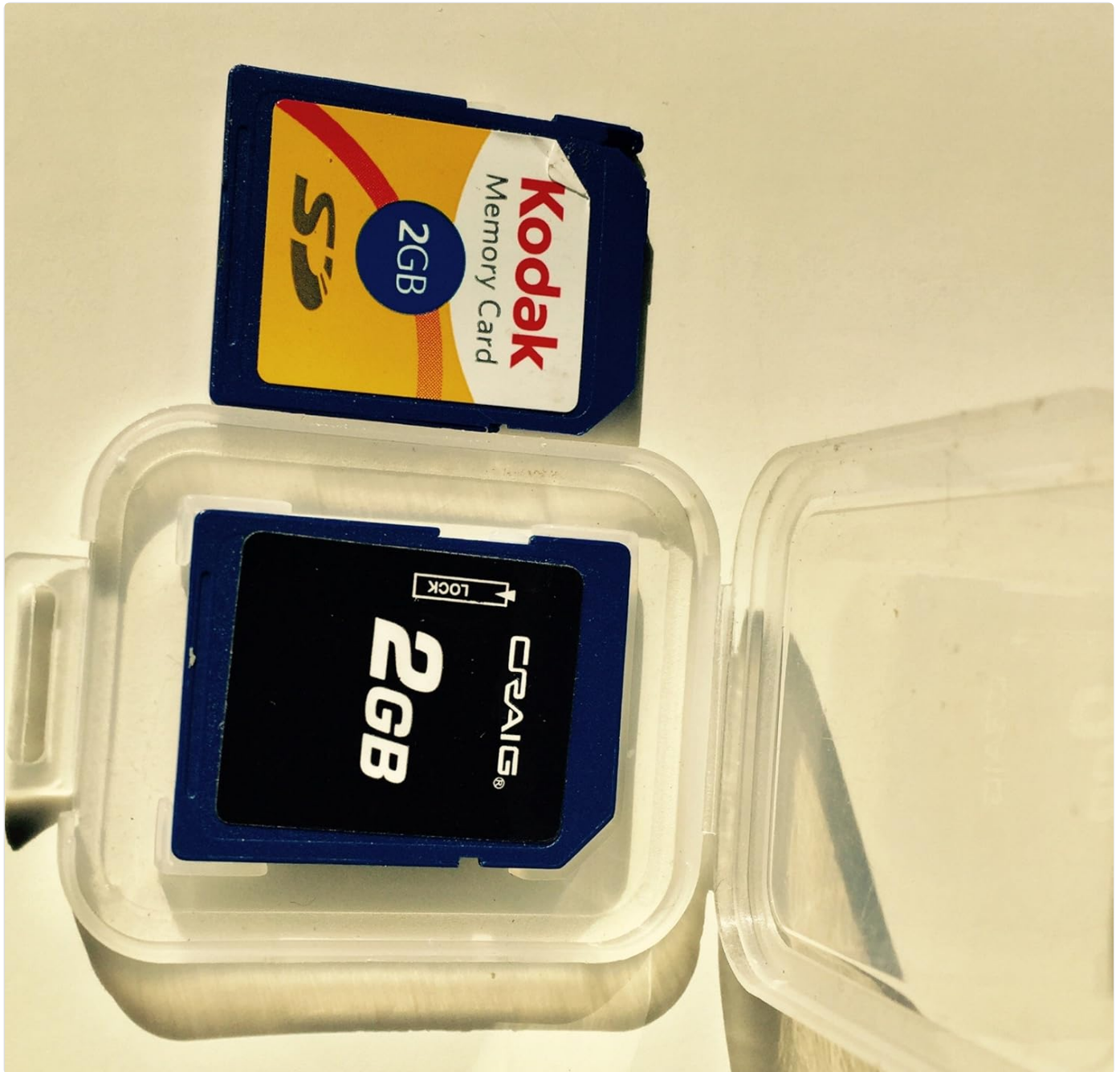
Image: SD and MMC Memory Cards. The camera supports both SD and MMC card types.

The camera has 32MB of internal memory. For extended shooting, insert an SD or MMC memory card.