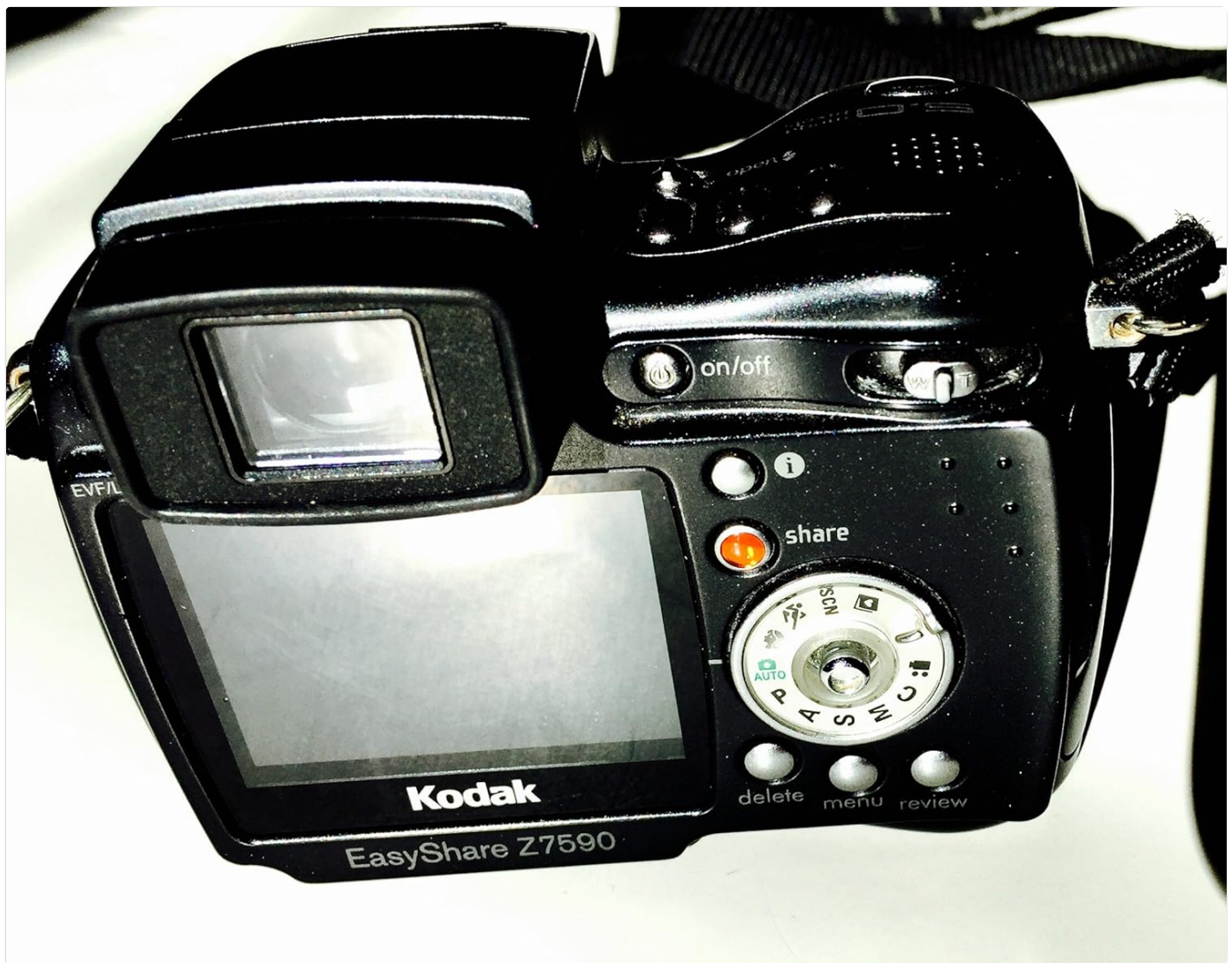
Image: Rear view of the KODAK EasyShare Z7590 Digital Camera. This image highlights the LCD screen, control dial, and various buttons such as 'on/off', 'share', 'delete', 'menu', and 'review'.