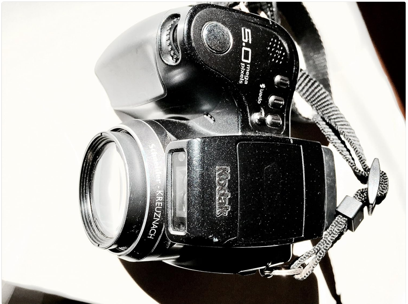
Image: KODAK EasyShare Z7590 Digital Camera. The camera is shown with the neck strap attached and the lens cap covering the lens.