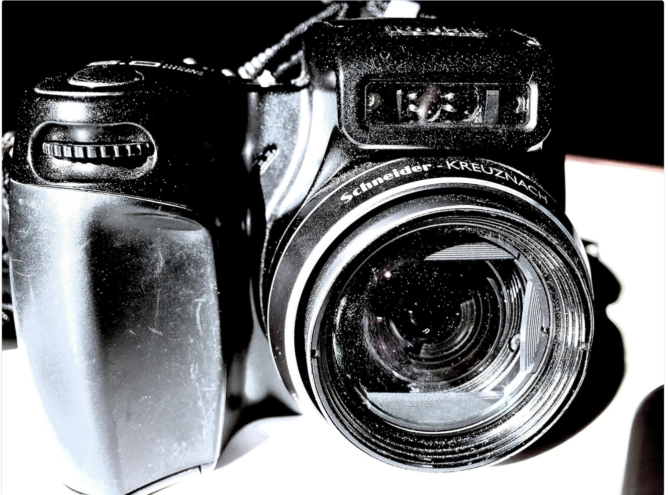
Image: Front view of the KODAK EasyShare Z7590 Digital Camera, highlighting the Schneider-Kreuznach Variogon lens with 10x optical zoom.