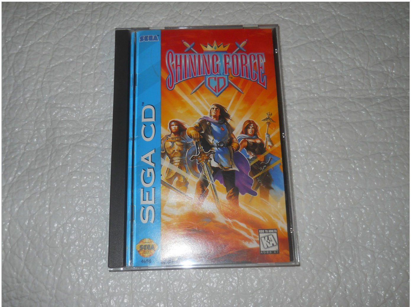
Figure 2.1: Shining Force CD game disc and internal manual.

Saving Game Progress: Shining Force CD utilizes the Sega CD's internal backup RAM or an optional CD Backup RAM Cartridge for saving game progress. Ensure sufficient space is available before starting a new game or saving. The game allows for multiple save slots.