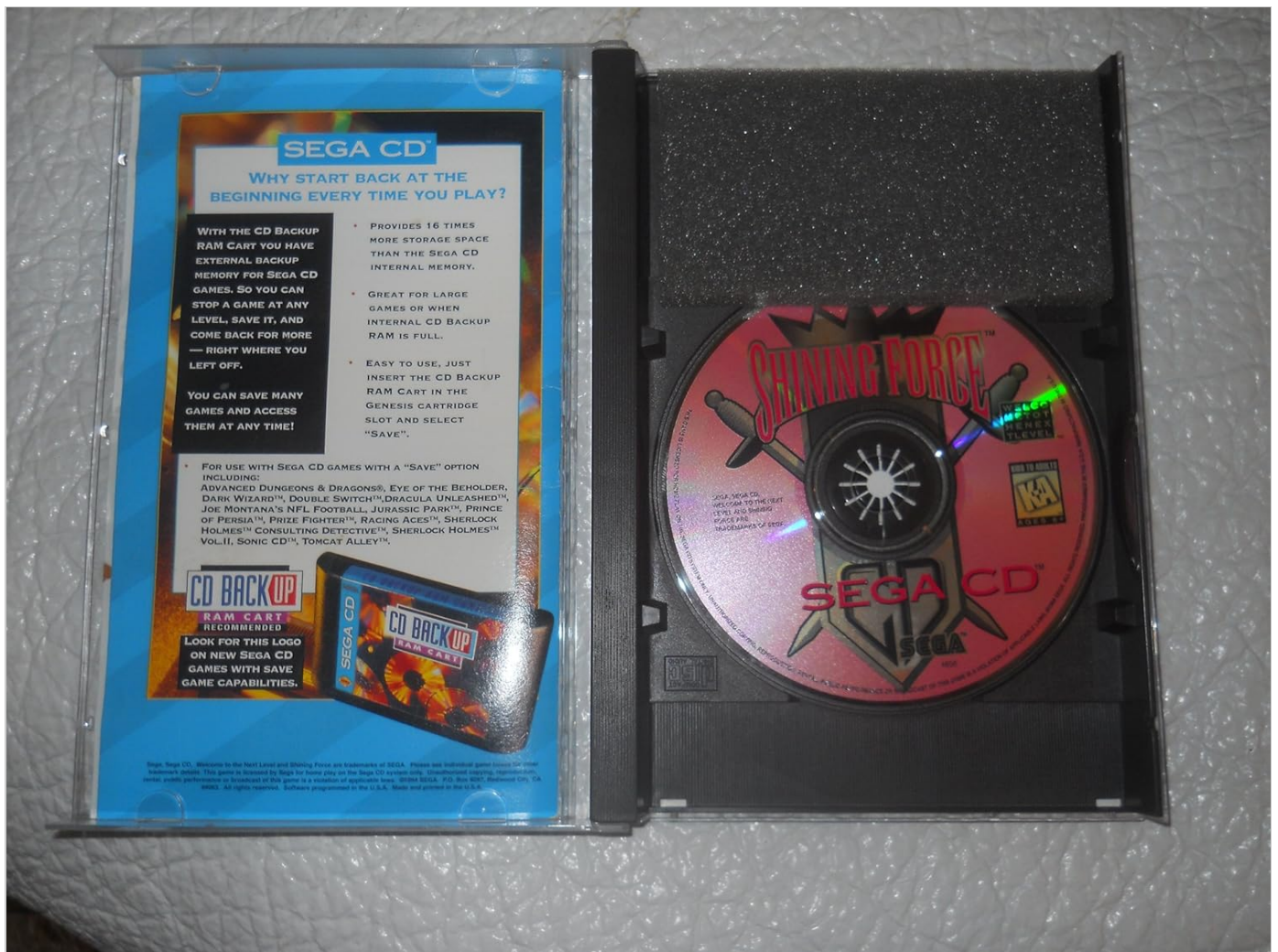
Figure 6.1: Back cover of the Shining Force CD game case, detailing features and copyright.