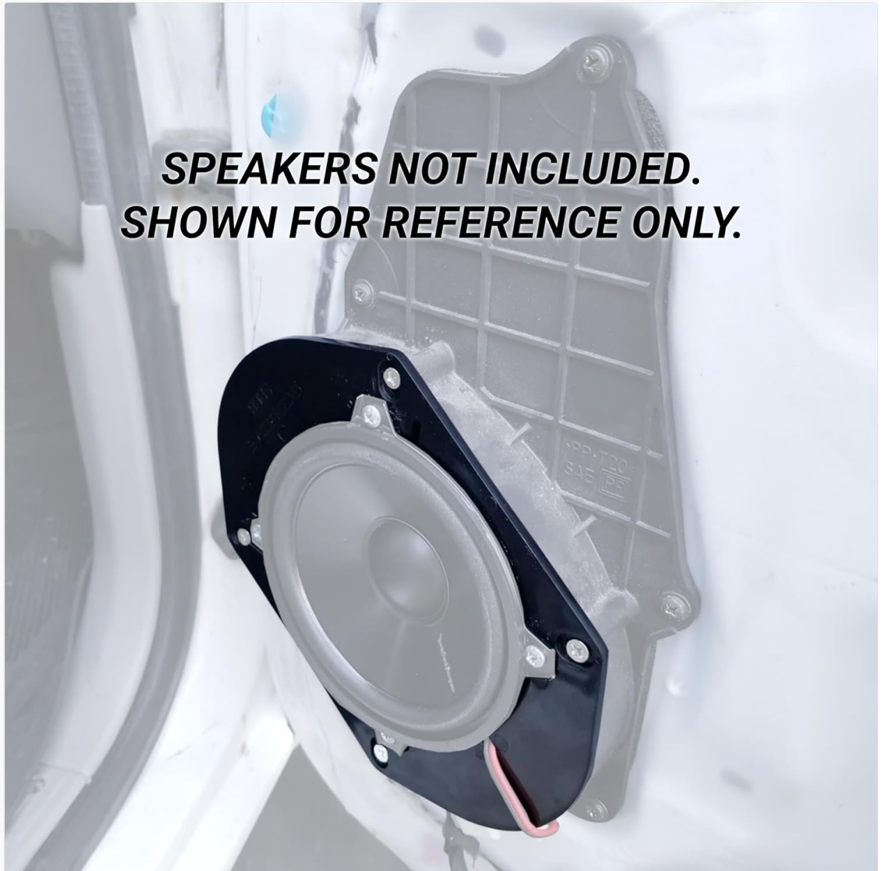
Image: A Scosche SA68 speaker adapter installed in a car door panel, with an aftermarket speaker mounted within it. This demonstrates the adapter's function in adapting the factory opening.