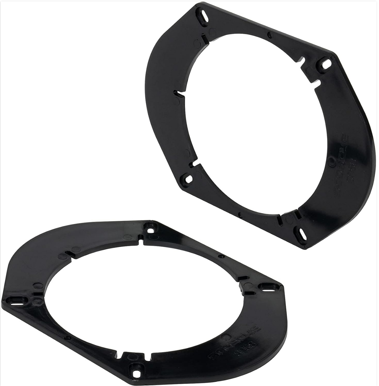
Image: A pair of black Scosche SA68 speaker adapters, designed to convert 5x7/6x8 inch openings to accommodate 5.25-6.5 inch speakers.