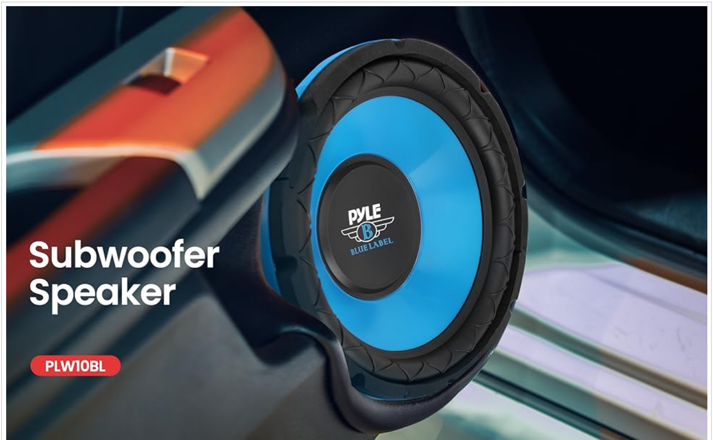
Image: The Pyle PLW10BL 10-inch Blue Label Subwoofer, showcasing its distinctive blue cone and robust construction.