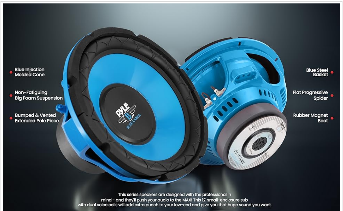
Image: An exploded view of the Pyle PLW10BL subwoofer, highlighting its internal components such as the blue injection molded cone, non-fatiguing foam suspension, bumped and vented extended pole piece, blue steel basket, flat progressive spider, and rubber magnet boot.