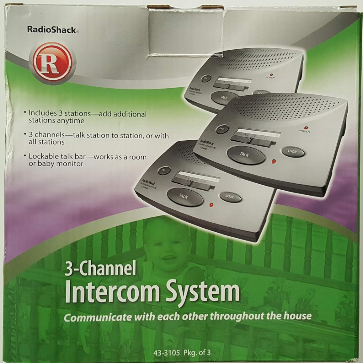
Image: The packaging for the RadioShack Advanced 3-Station/3-Channel FM Wireless Intercom system, showing three intercom units. The packaging highlights key features: "Includes 3 stations—add additional stations anytime," "3 channels—talk station to station, or with all stations," and "Lockable talk bar—works as a room or baby monitor." The model number "43-3105 Pkg. of 3" is also visible.