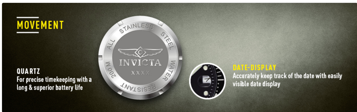
Figure 5: Illustration of the watch's quartz movement and the date display window.