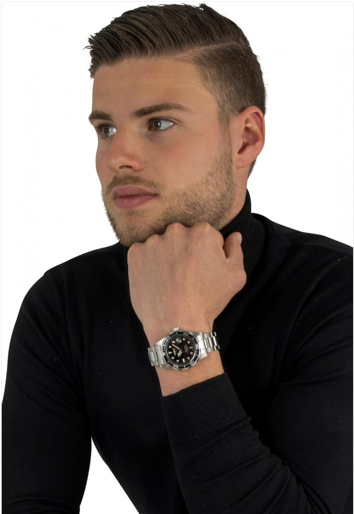
Figure 2: Side view of the watch, illustrating the position of the crown for adjustments.