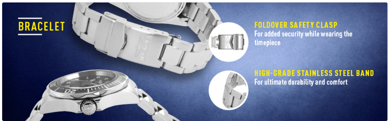
Figure 3: Close-up view of the stainless steel bracelet and its fold-over safety clasp.