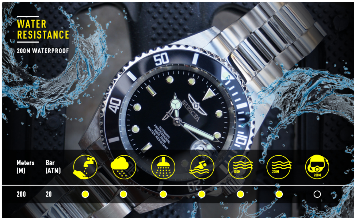
Figure 6: Water resistance chart detailing appropriate usage for various depths, confirming 200M suitability for diving.

Your Invicta Pro Diver Watch Model 8932 is rated for water resistance up to 200 meters (660 feet). This means it is suitable for professional marine activities, surface water sports, and diving. Crucial Note: Always ensure the crown is fully pushed in and secured before the watch comes into contact with water. Never operate the crown or push buttons while the watch is wet or submerged, as this can compromise its water resistance.