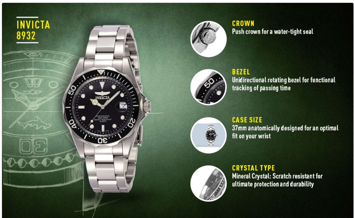
Figure 4: Key features of the Invicta 8932, including the unidirectional bezel, crown, case size, and mineral crystal.

The Invicta 8932 features a unidirectional rotating bezel. This bezel rotates only counter-clockwise, which is a safety feature for divers to prevent accidental overestimation of elapsed time. To use it, align the zero marker on the bezel with the minute hand at the beginning of an activity you wish to time. As time passes, the minute hand will point to the elapsed time on the bezel's scale.