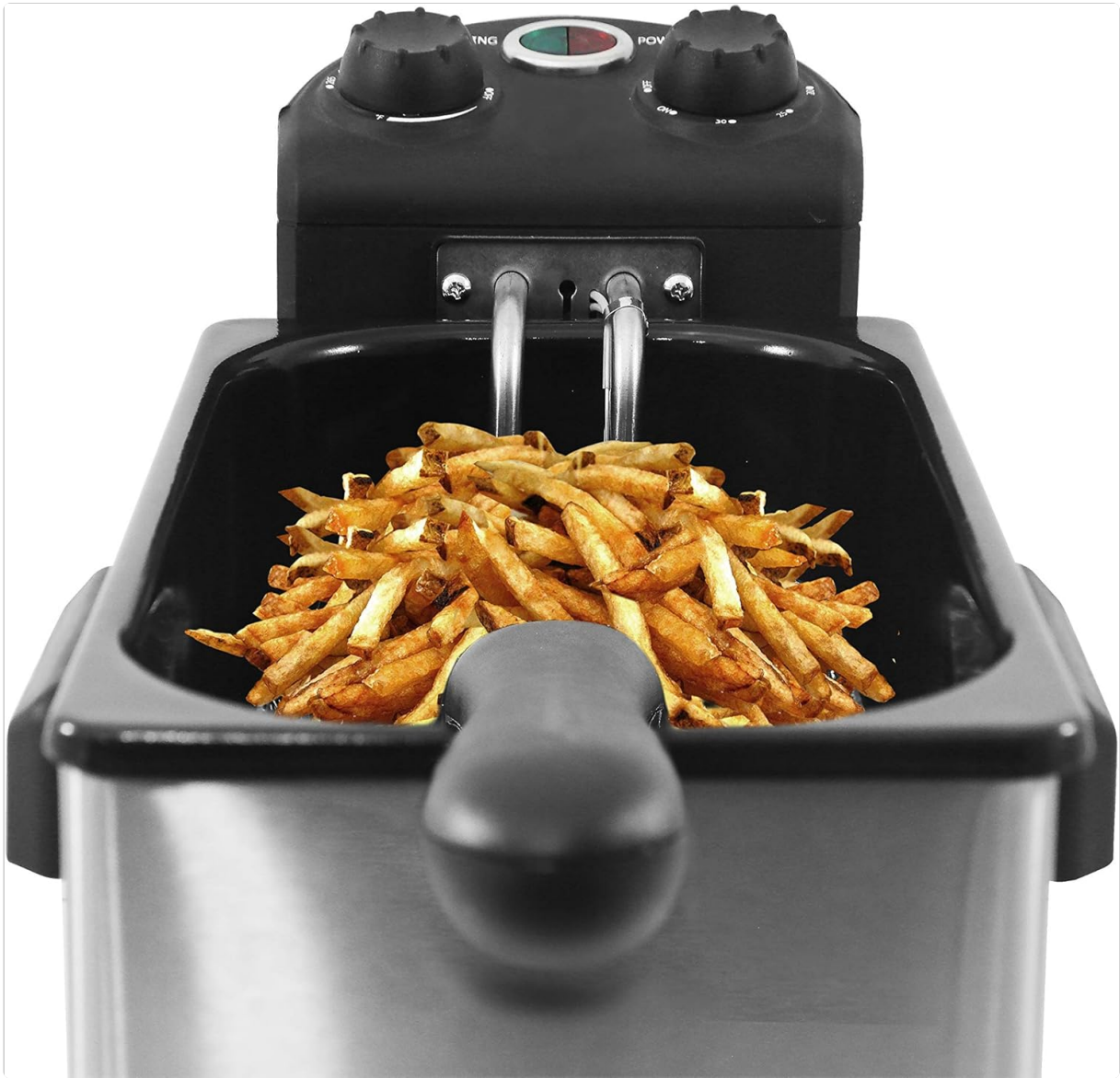
Close-up of the control panel showing the adjustable temperature and timer knobs, along with power and heating indicator lights.