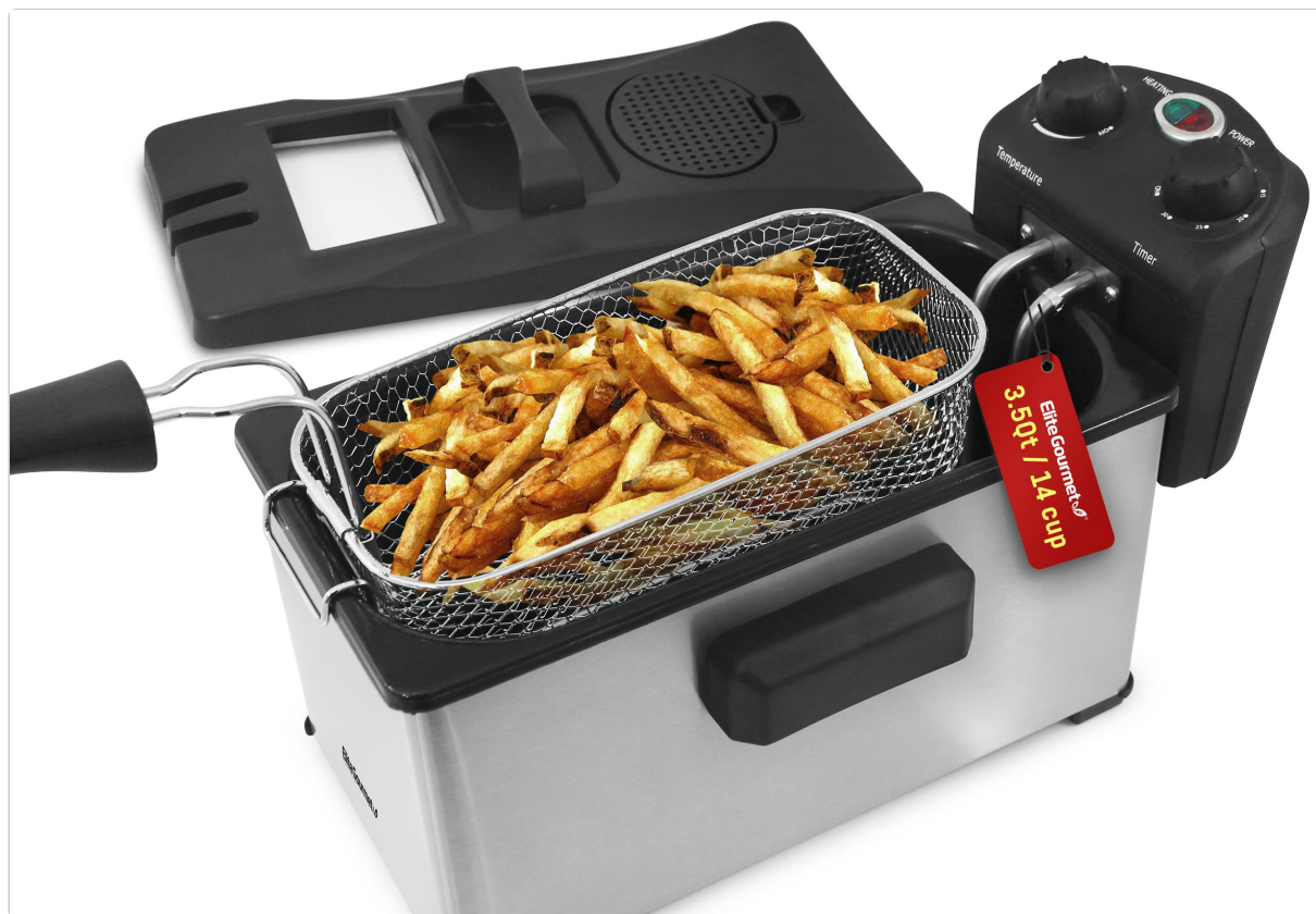
The Elite Gourmet EDF-3500 Electric Immersion Deep Fryer, ready for use with a basket of fries.