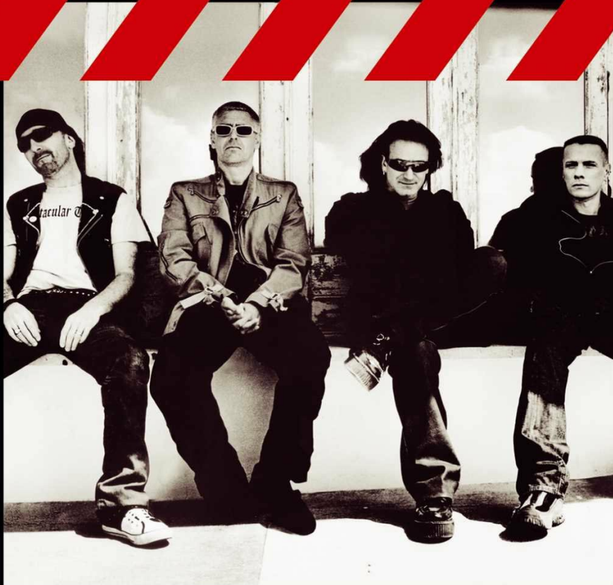
Figure 1: Front cover of the "How to Dismantle An Atomic Bomb" Audio CD. This image displays the album artwork featuring the band members.