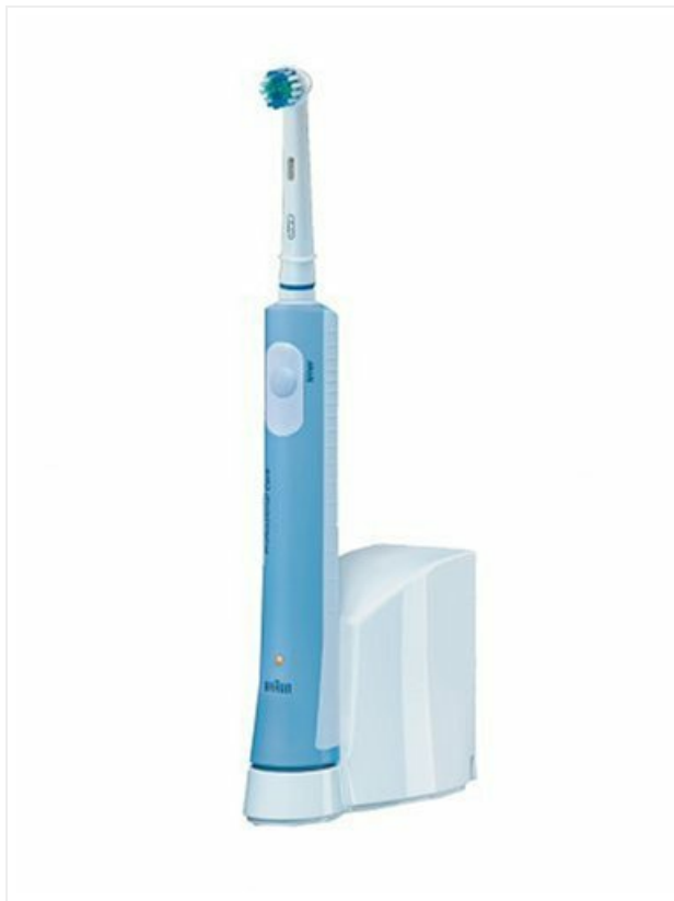
Image: The Oral-B ProfessionalCare 5000 XL d15.511 electric toothbrush with its charging base.