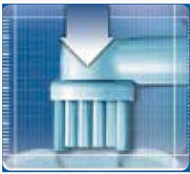
Image: Diagram illustrating the process of attaching a brush head to the toothbrush handle.

Align the brush head with the shaft of the toothbrush handle and push it down firmly until it clicks into place.