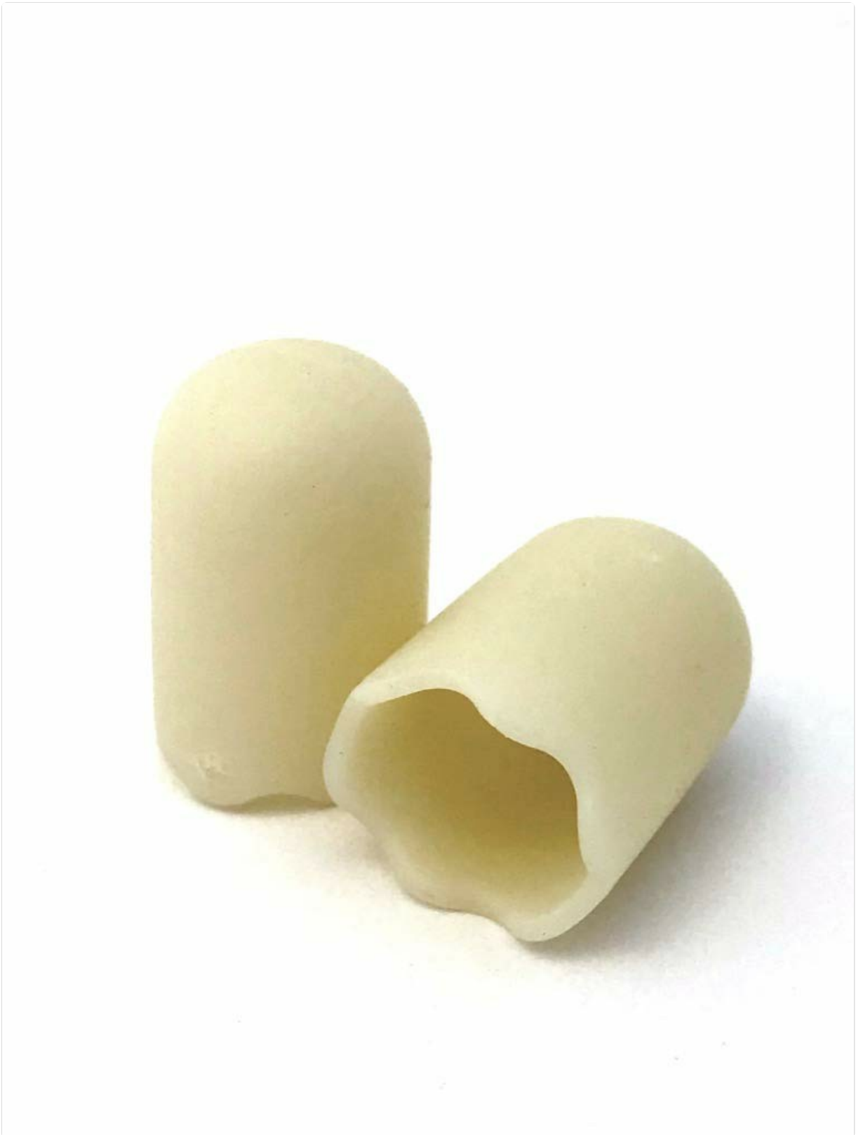
Figure 2: A close-up of the Wedgie Anti-Vibe Shox, illustrating their design and material.

The flexible material of the shox allows for a secure fit on various drumstick diameters without permanent modification to your sticks.