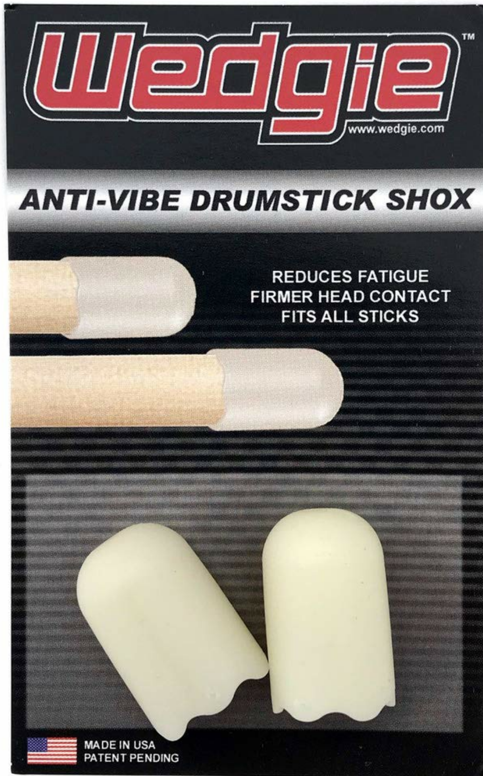
Figure 1: Front view of the Wedgie Anti-Vibe Drumstick Shox packaging, highlighting its primary features.