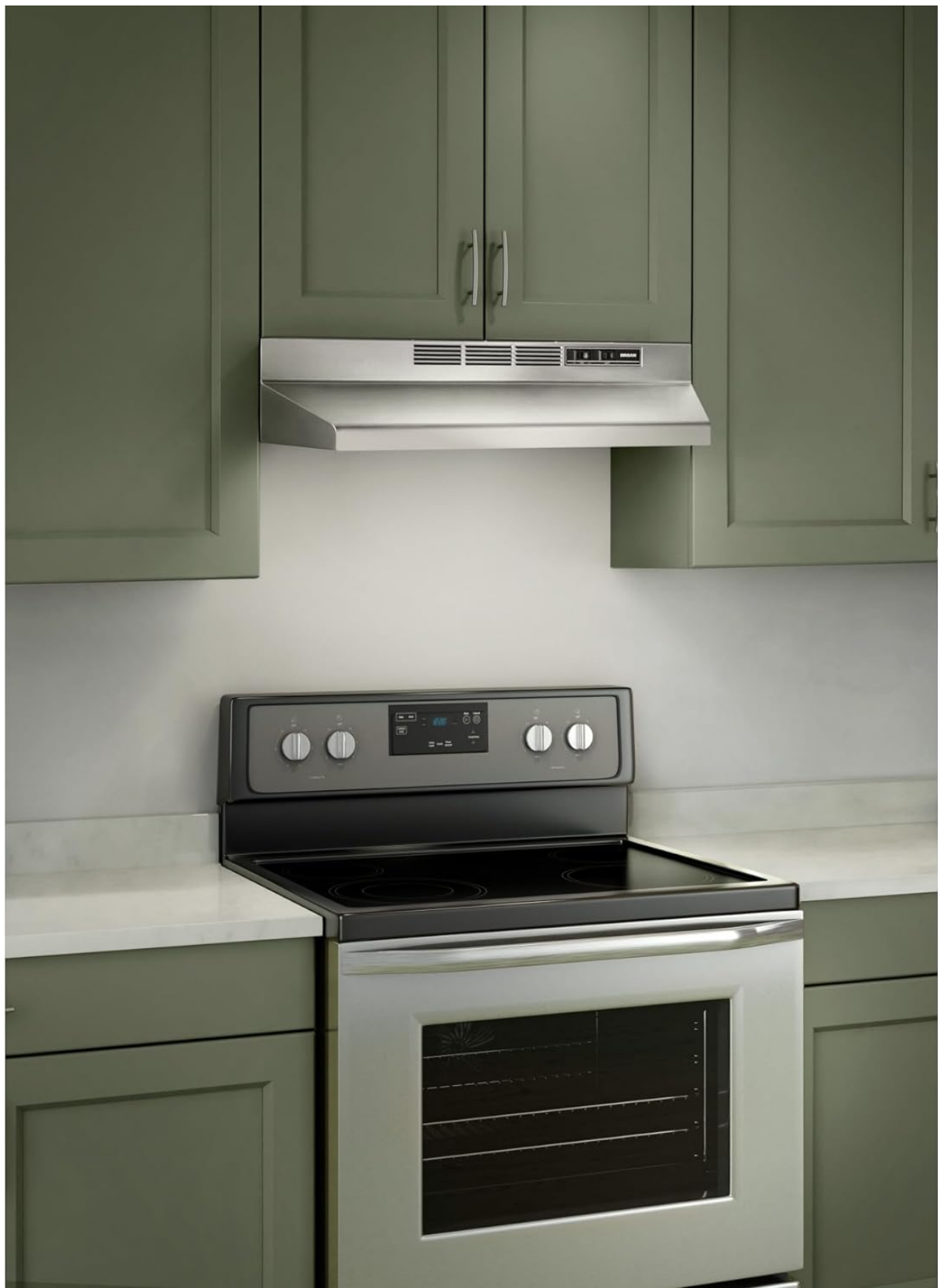
Figure 2: The Broan-NuTone 413004 range hood seamlessly installed under a kitchen cabinet, demonstrating its sleek stainless steel appearance in a typical kitchen setting.