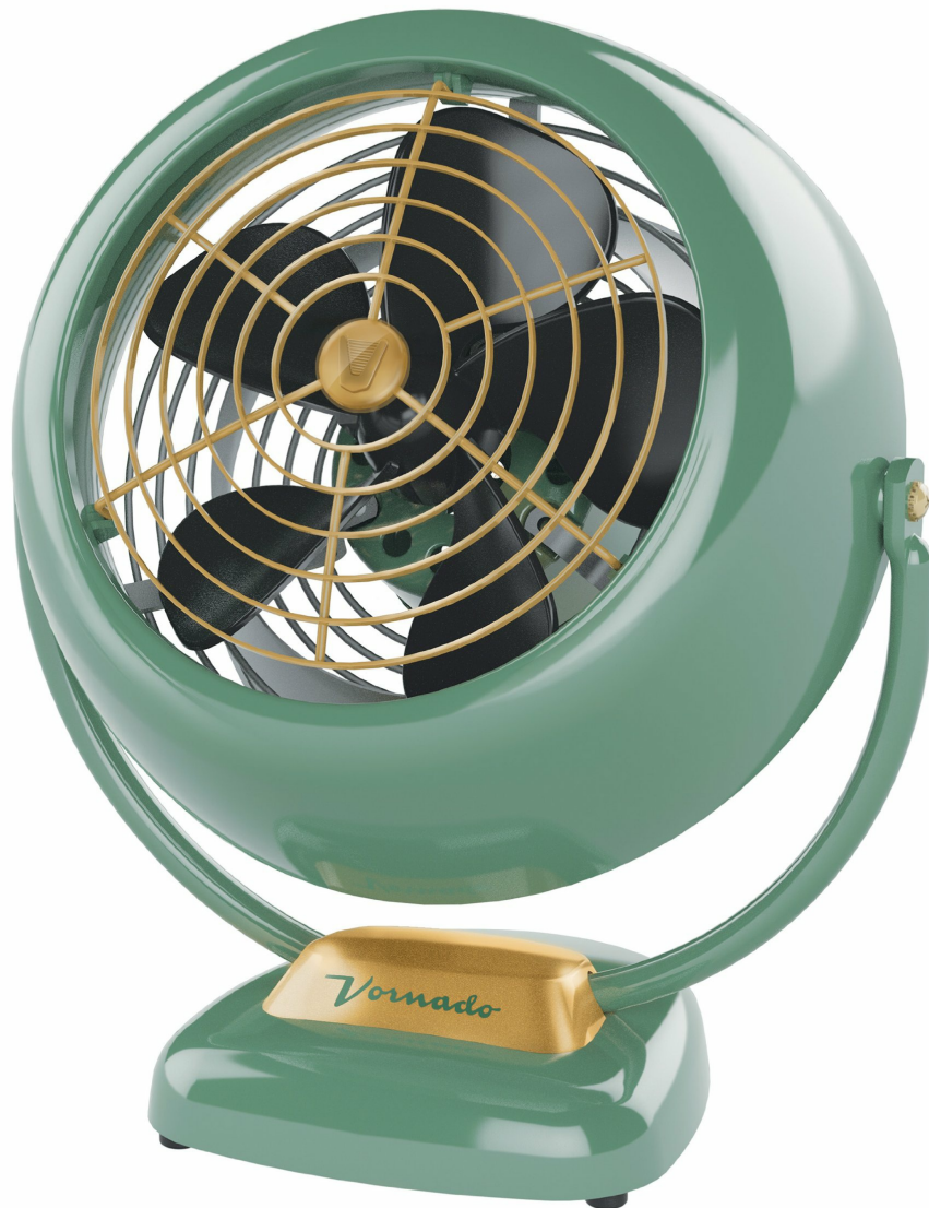
Front view of the Vornado VFAN Vintage Air Circulator Fan in green. The fan features a classic design with a metal grille and base.