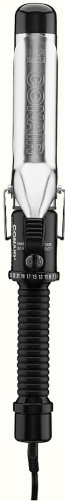
1 1/4 in. Conair® Double Ceramic Curling Iron