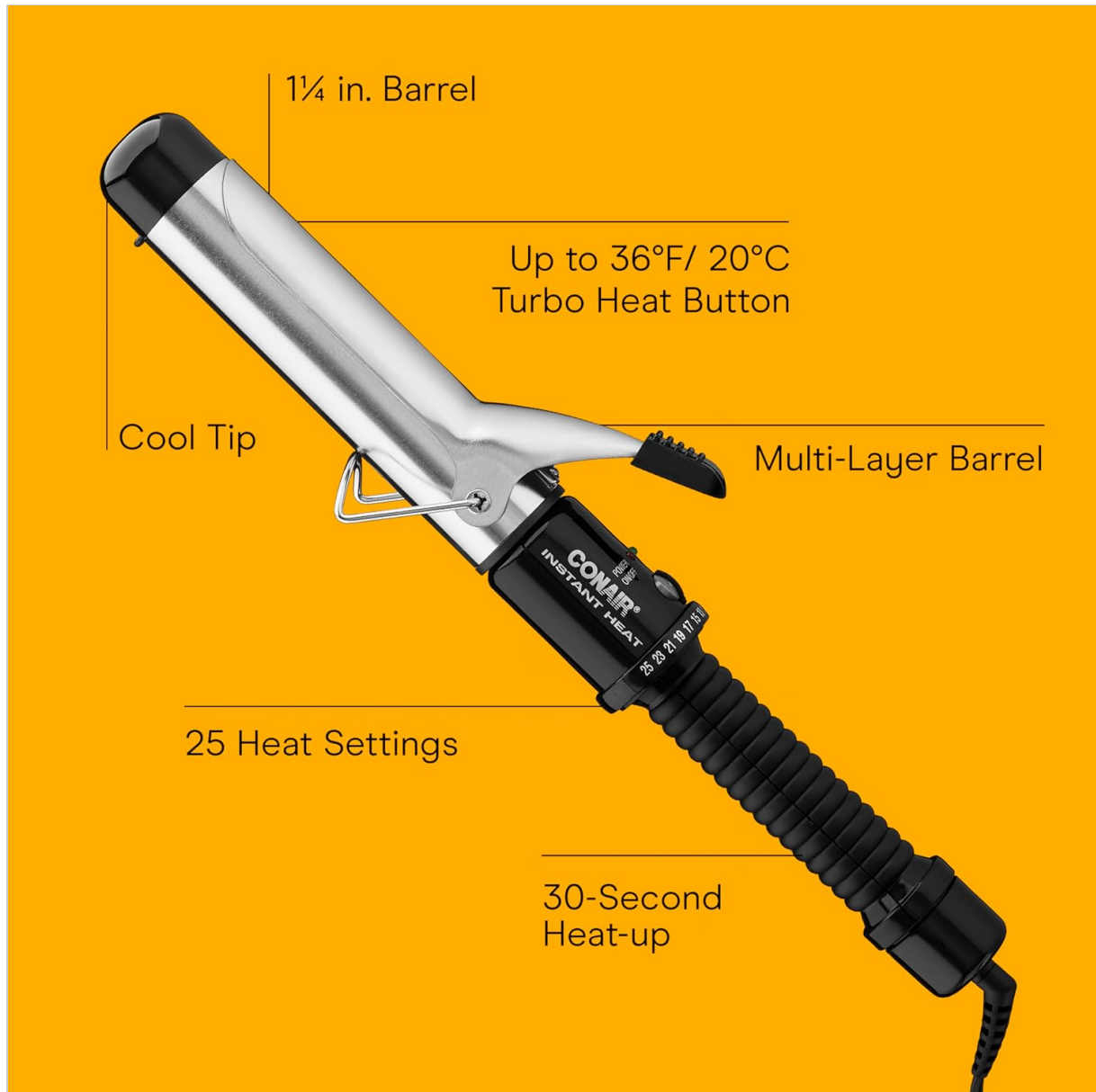
Image: A detailed diagram highlighting the features of the Conair Instant Heat Curling Iron, including the 1-1/4 inch barrel, cool tip, multi-layer barrel, 25 heat settings, 30-second heat-up, and turbo heat button.