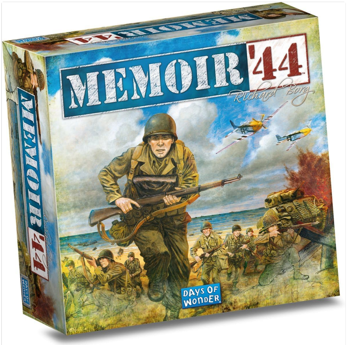
Image 1.1: The Memoir '44 game box, featuring a World War II battle scene.