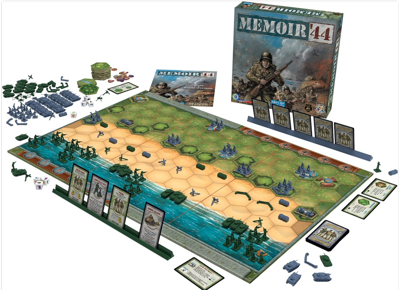
Image 6.1: A detailed view of the Memoir '44 game board, showcasing various terrain tiles and miniature units in action.

Refer to the Scenario Book and the Summary Cards for detailed information on specific special rules and terrain effects for each battle.