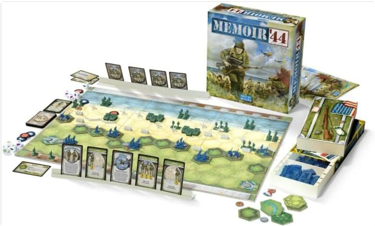
Image 4.1: A close-up of Command cards and Attack Dice, essential for gameplay.

Your browser does not support the video tag.