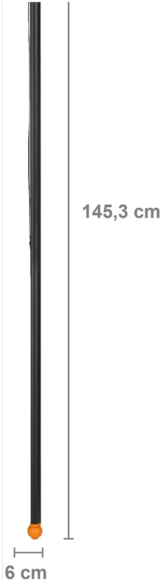
Figure 4: Dimensional diagram of the Fiskars Extension, indicating its length.