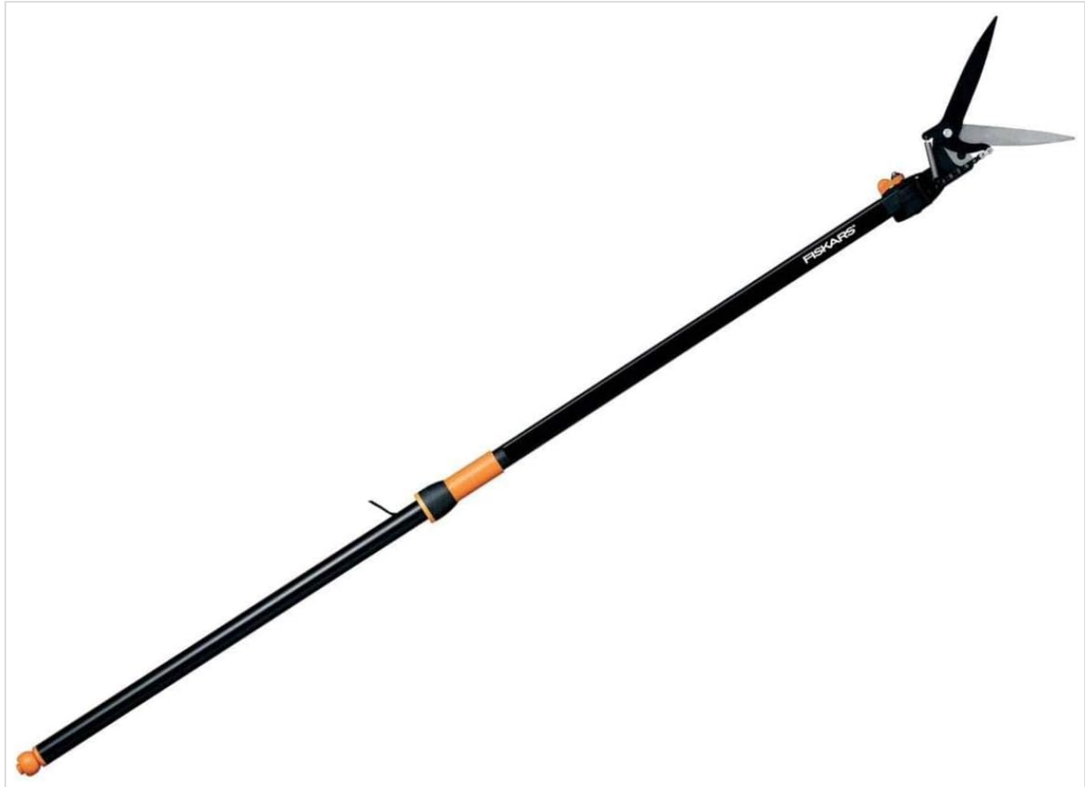
Figure 1: The Fiskars Extension 1001560, illustrating its full length and design.

The Fiskars Extension 1001560 consists primarily of a lightweight aluminum pole with a specialized locking mechanism for secure attachment to compatible Fiskars tree pruners. It features a black and orange color scheme, consistent with Fiskars tools.